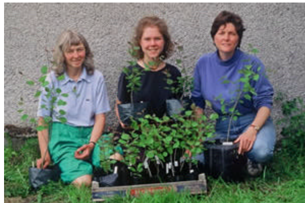
The aspens in this tray have grown from cuttings which were planted 4 months previously. The larger plants are in their second year of growth in pots.