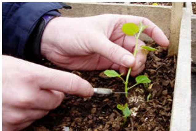
The suckers are severed near where they emerge from the parent root.