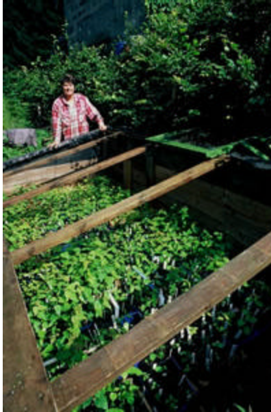
A cold frame full of aspen plants grown from root cuttings at Plodda Lodge.