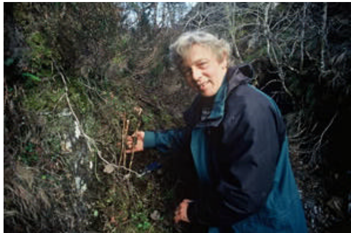
Aspen roots exposed and ready to cut.

Lines of suckers such as this indicate the location of aspen roots. These are obviously easiest to spot when the suckers have leaves on them, so their location should be scouted out in the summer prior to when roots will be collected.