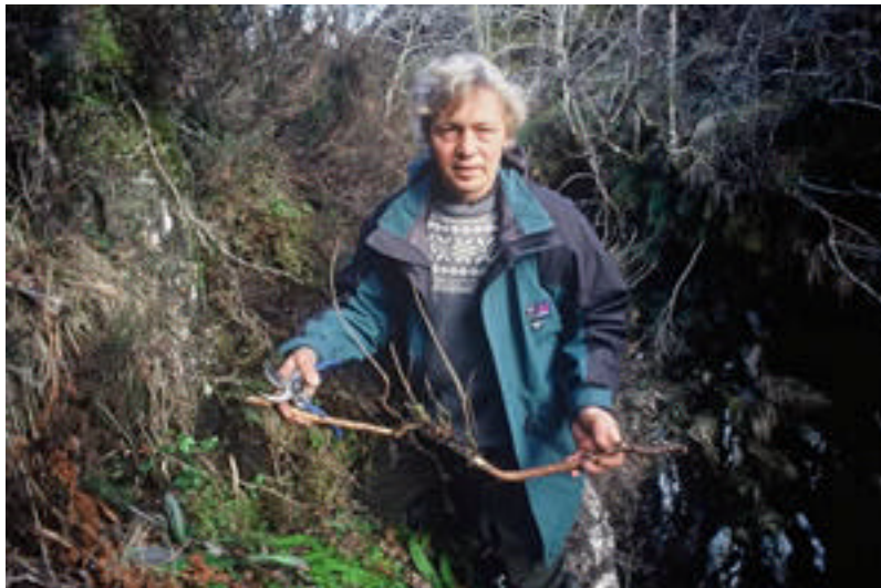
In this example, the root has several suckers growing out of it.