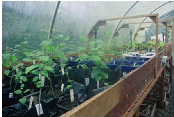
The misting unit in our Aspen Propagation Facility at Plodda Lodge. Newly-planted cuttings are in the blue trays in the middle, while larger, more established aspens are in the foreground.