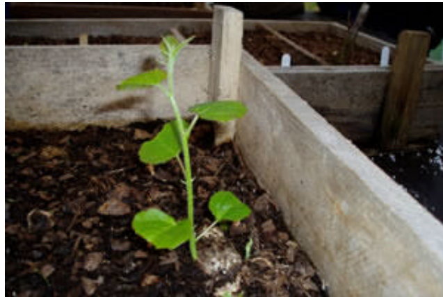
This sucker is the right size to cut and root as a separate plant.