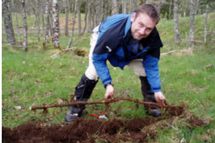
Sometimes it's possible to collect a long section of a single root.