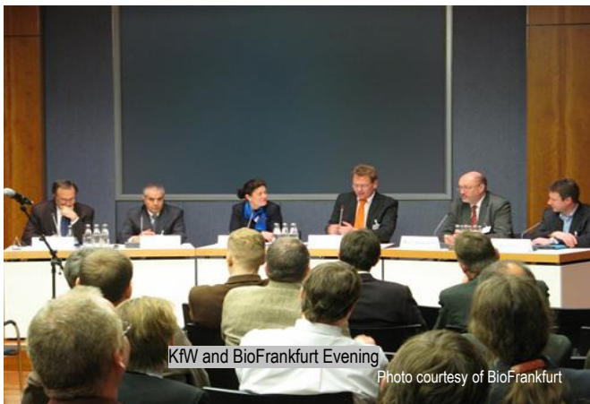
KfW and BioFrankfurt Evening