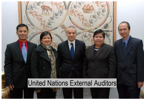
United Nations External Auditors