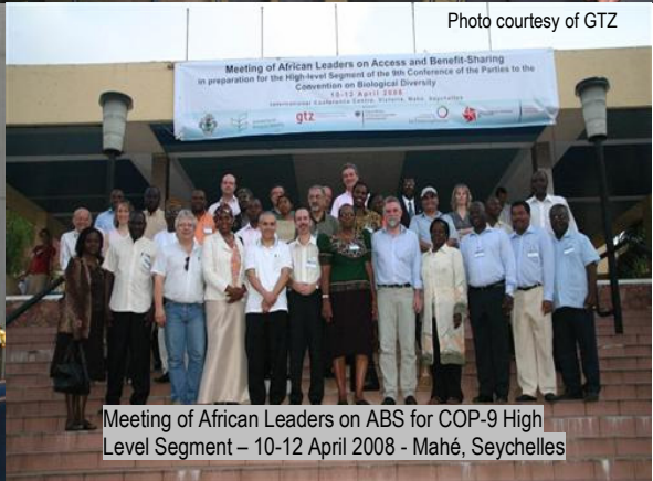
Meeting of African Leaders on ABS for COP-9 High Level Segment – 10-12 April 2008 - Mahé, Seychelles