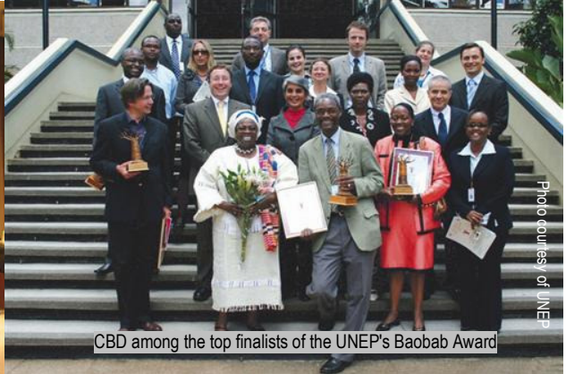
CBD among the top finalists of the UNEP's Baobab Award