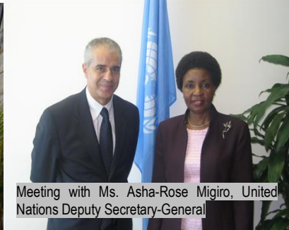
Meeting with Ms. Asha-Rose Migiro, United Nations Deputy Secretary-General