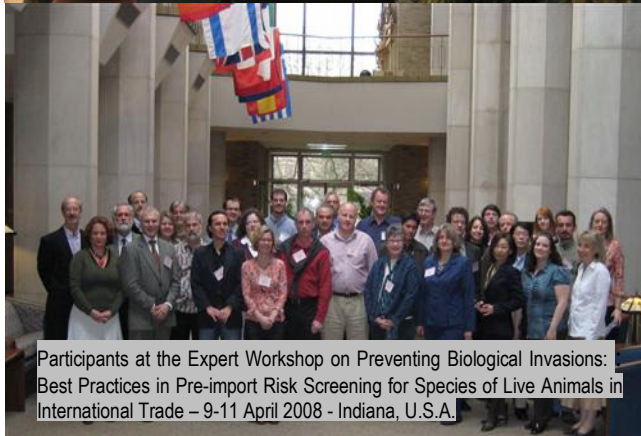
Participants at the Expert Workshop on Preventing Biological Invasions: Best Practices in Pre-import Risk Screening for Species of Live Animals in International Trade – 9-11 April 2008 - Indiana, U.S.A.