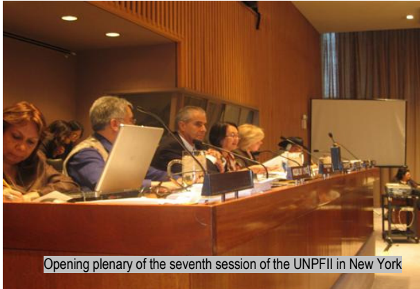
Opening plenary of the seventh session of the UNPFII in New York