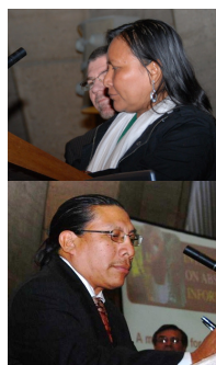
Signing ceremony at the WGABS-7 meeting.

The members of the Interagency Task Force on Access and Benefit Sharing met prior to the WGABS-7 meeting. The CBD Executive Secretary and the two ABS Co-Chairs briefed the Task Force on their approach and expectations for the upcoming meeting and related events. The members of the Task Force had an opportunity to share developments within their own processes of relevance to access and benefit-sharing.