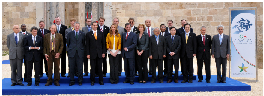
Participants at the G8 Environment Ministers meeting.

http://www.g8ambiente.it/public/images/20090424/doceng/09_04_24_Chair%20Summary.pdf