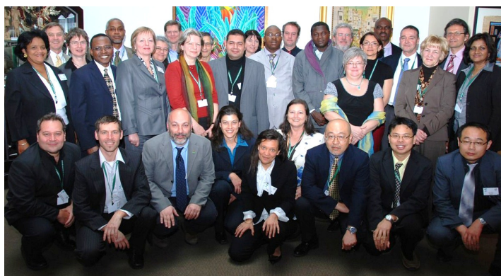
Participants at the meeting.

The First Meeting of the Ad hoc Technical Expert Group on Risk Assessment and Risk Management under the Cartagena Protocol on Biosafety was held from 20 to 24 April 2009 at the CBD Secretariat in Montreal, Canada. In pursuance of the terms of reference as contained in the Annex to decision BS-IV/11, the Group discussed the development of guidance documents with the view to further support countries in conducting risk assessment of living modified organisms (LMOs) in the context of the Protocol. The participants produced a draft text for a roadmap on the steps in risk assessment and established four sub-working groups to further undertake the development of the roadmap and guidance documents on specific aspects of risk assessment and risk management prior to the Group's second meeting, scheduled to be held in April 2010 in Ljubljana, Slovenia.