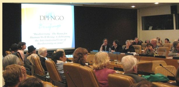
DPI/NGO Briefings.

A DPI/NGO briefing on " Biodiversity - the basis for human well-being: Celebrating the International Year of Biodiversity in 2010 " was held on 30 April at the U.N. headquarters in New York. The event, which gathered more than 120 representatives, provided an opportunity for the Secretariat of the Convention on Biological Diversity to inform participants on CBD implementation plan for the International Year of Biodiversity, as well as provide information on ways to engage the civil society organizations to contribute and take part in the celebrations.