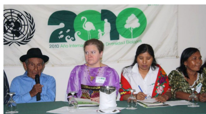
Deliberations at the meeting.

The LAC capacity building workshop was the sixth in a series of seven workshops, which took place in the City of Panama, Panama on 11-13 August 2010. Forty representatives of indigenous and local communities of the Latinoamerica region