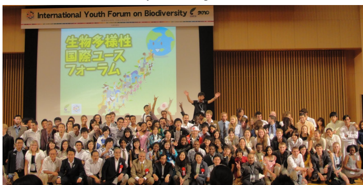
Participants at the International Youth Conference on Biodiversity

On 27 August, the CBD Executive Secretary participated in the International Youth Conference on Biodiversity in Aichi 2010, held at the Nagoya University, organized by the Ministry of the Environment, the Ministry of Foreign Affairs and Aichi Prefec-