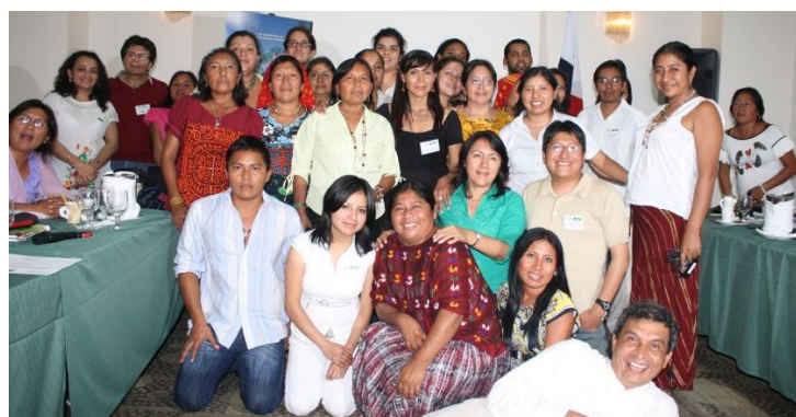
Participants at the meeting.

participated in the workshop. The workshop provided an opportunity to strengthen capacities of participants in understanding the processes of the Convention, preparing documents for proposals, and suggestions to improve future workshops. It also allowed the exchange of relevant national and regional experiences within the Latinoamerica region. At the end of the workshop, participants expressed that they are better prepared to work with other members of their respective indigenous and local communities on the subject matter covered and more knowledgeable about the processes of the Convention and how to participate effectively in influencing its results. The meeting also allowed participants to acquire a better understanding of the agenda and the issues currently being addressed in the processes towards COP 10. Participants were provided with an opportunity to participate in an improvised COP meeting and demonstrated a good understanding of the processes and how outcomes could be influenced. Participants seemed eager to go back and share their experience and learning with members of their organizations and communities. Participants expressed many thanks to Secretariat of the Convention on Biological Diversity, the Indigenous Women's Biodiversity Network for the Latin American and Caribbean Region (LAC IWBN) and Spain Government for the realization of the workshop.