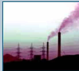
PS3: Resource Efficiency and Pollution Prevention