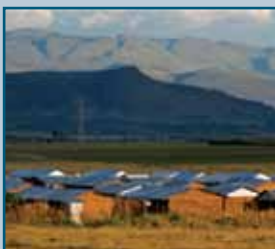
PS5: Land Acquisition and Involuntary Resettlement