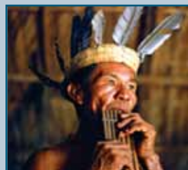
PS3: Resource Efficiency and Pollution Prevention