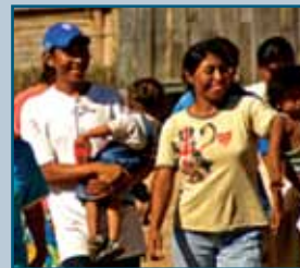
PS4: Community Health, Safety and Security