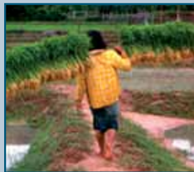
PS2: Labor and Working Conditions