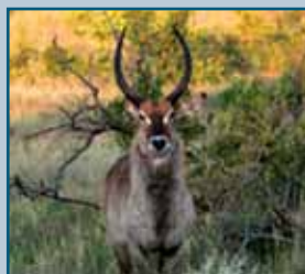
PS6: Biodiversity Conservation and Sustainable Management of Living Natural Resources