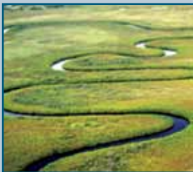
PS1: Assessment and Management of E&S Risks and Impacts