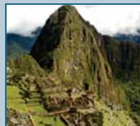
PS4: Community Health, Safety and Security