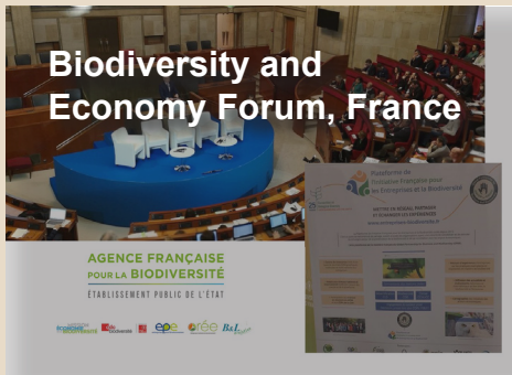
Biodiversity and Economy Forum, France