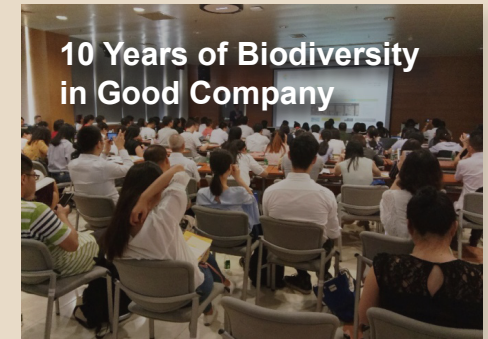
10 Years of Biodiversity in Good Company