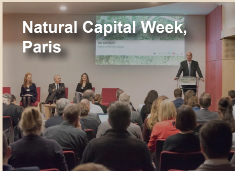
Natural Capital Week, Paris

Global Partnership for Business and Biodiversity