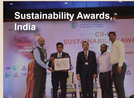
Sustainability Awards, India