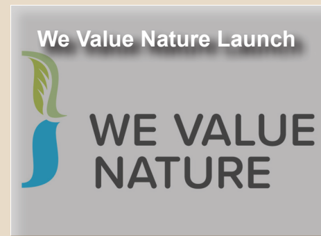
We Value Nature Launch