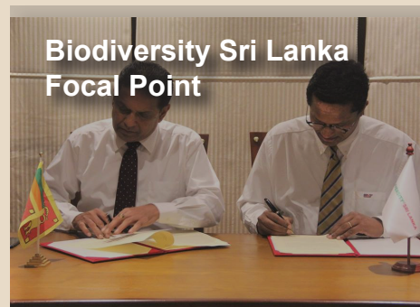
Biodiversity Sri Lanka Focal Point