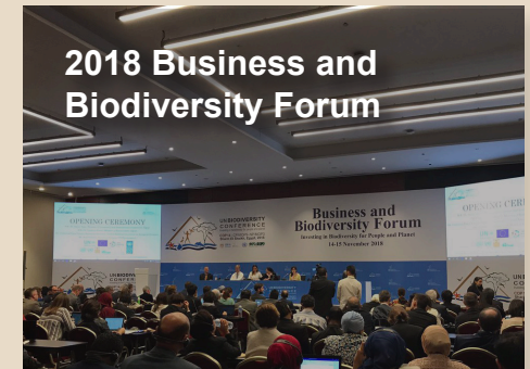
2018 Business and Biodiversity Forum