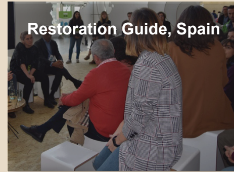
Restoration Guide, Spain