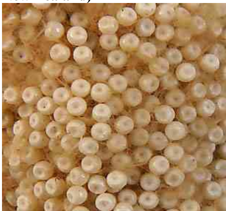
Figure 2 Painted apple moth egg mass, recently laid

Eggs are white or greyish and laid on the cocoon and about 1mm in diameter (Phillips, 1992; Riotte, 1979) (figure 2).