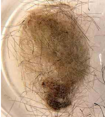
Figure 4 Painted apple moth cocoon

Painted apple moth poses a serious threat to New Zealand's gardens, crops, forests, native bush, and the communities that depend on them. The pest is a voracious and indiscriminate feeder and destroys plants by eating their leaves. It is considered a minor pest in its native Australia where it and other moths are controlled by orchardists using pesticides.