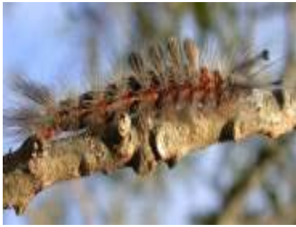
Figure 3 Painted apple moth larva

Larvae are solitary, reaching about 3cm when fully grown. They are densely covered with brown hairs, with four brush-like tufts of white hairs on the back and two forward-pointing, horn-like tufts of black hairs behind the head (figure 3).