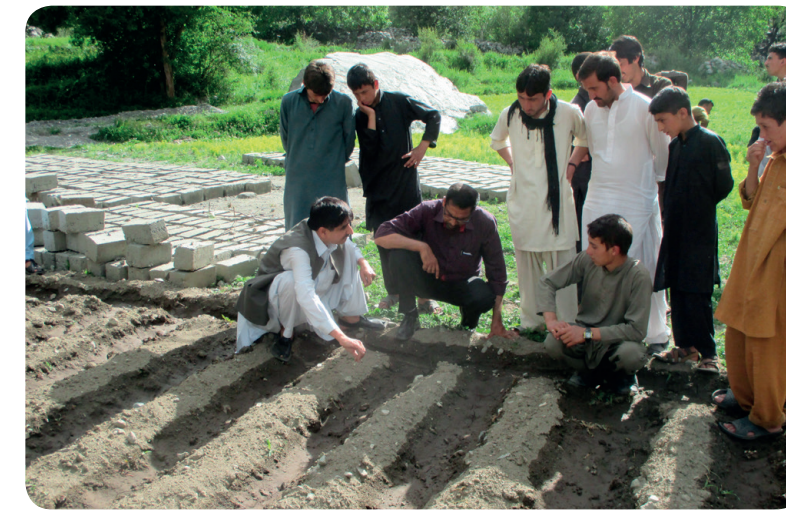
Farmers of Chitral receive a demonstration of a drip-irrigation scheme.

The Government of Punjab, WWF-Pakistan and IKEA have been collaborating under "Pakistan Sustainable Cotton Initiatives (PSCI)" since 2005 for the development and promotion of site-specific Better Management Practices (BMPs). More than 50,000 farmers participated in the program to grow better cotton over an area of 200,000 ha in 2011. Results included a reduction of 37.5 % in water use, 47 % in pesticide use and around 41% in fertilizer use, leading to a cost-benefit ratio of 1:2.3 for farmers using BMP compared to 1:1.1 by non-BMP farmers. This model is currently being up-scaled to include additional crops like rice and sugarcane over larger agricultural surfaces. Farmers are slowly adopting micro irrigation systems, are increasingly planting low delta crops and are changing cropping patterns, thus contributing to biodiversity conservation. It's Pakistan's participatory approach towards sustainable agriculture, including measures such as diversification of crops and micro irrigation systems, and less use of synthetic pesticides and fertilizers that provides an important framework to strengthen climate change resilience of rural communities.