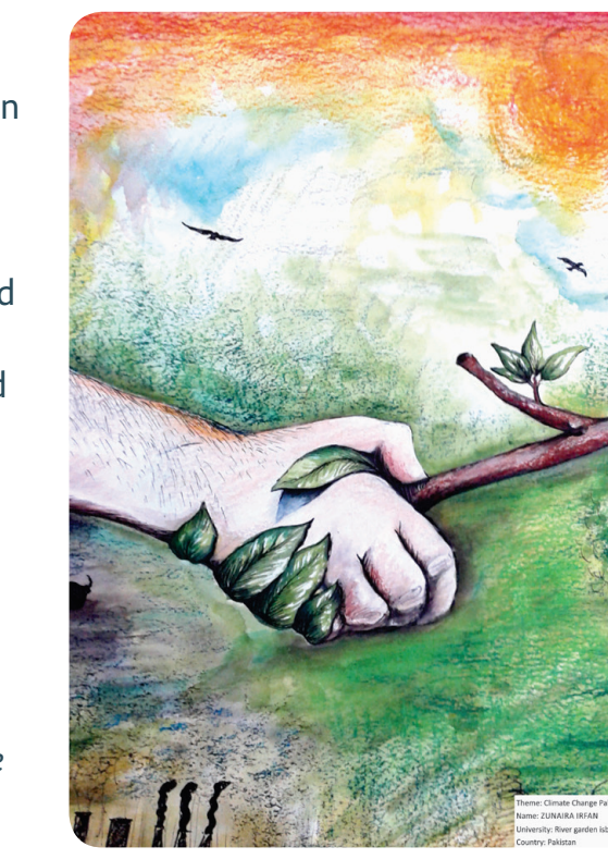
Painting competition on Pakistan's climate change resilience held by the Ministry of Climate Change.

All the relevant bodies are working together to create awareness and to initiate the REDD+ Readiness process in Pakistan. The inputs acquired through this process will be utilized to develop the REDD+ National Strategy and Implementation Plan. Pakistan prepared an R-PP (Readiness Preparation Proposal) to be implemented in the period from January 2014 to December 2017. Provincial Forest Departments of Punjab, Sindh, Balochistan, Khyber-Pakhtunkhwa, Aik and Gilgit-Baltistan have designated their respective provincial Focal Points for REDD+.