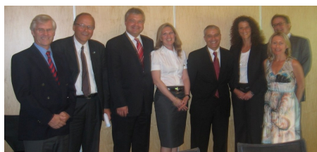
Meeting with officials of AIRBUS, 27 June 2008, Toulouse France