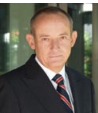
Yvo de Boer, Executive Secretary, United Nations Framework Convention on Climate Change (UNFCCC)

In addition, the Ville de Montréal—through its nature museums—is equally pleased to offer support to a network of prestigious scientific partners, in order to ensure that we meet the 2010 Biodiversity Target set in the Convention of Biological Diversity. To get there, we will have to face the major challenge that climate change represents. Cities have a role to play in finding solutions to the problems of both biodiversity and climate change. ❖