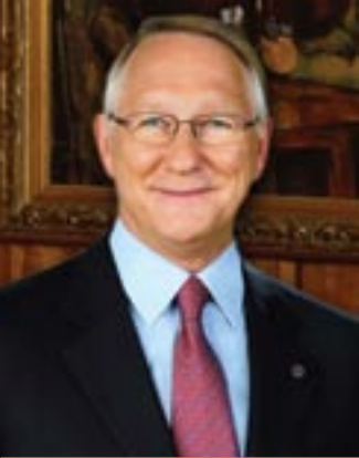
Gérald Tremblay, Mayor of Montréal