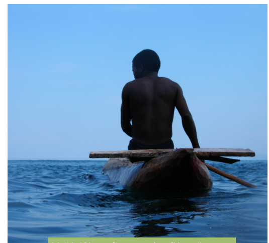
Lake Malawi fisherman.