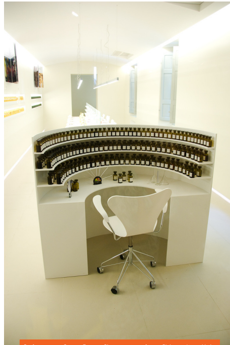
Perfume organ, Grasse, France.

Recognizing that plants have long been used in beauty products as a source of essential oils and aroma compounds, a collective policy by the beauty industry on sourcing raw material that discourages loss of biodiversity and biopiracy, promotes sustainable use and economic opportunities for farmers can go a long way in implementing the CBD. In the past, demands for aromatic materials like sandalwood, agarwood, and musk has led to the endangerment of these species as well as illegal trafficking and harvesting.