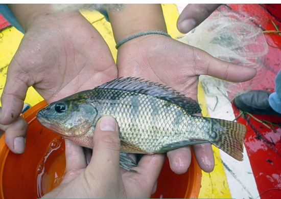
Oreochromis sp. (Tilapia).