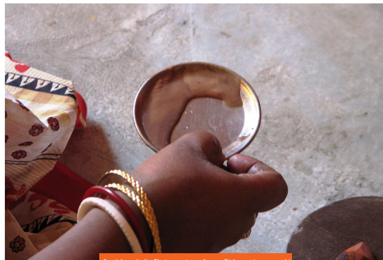
Sandalwood oil.