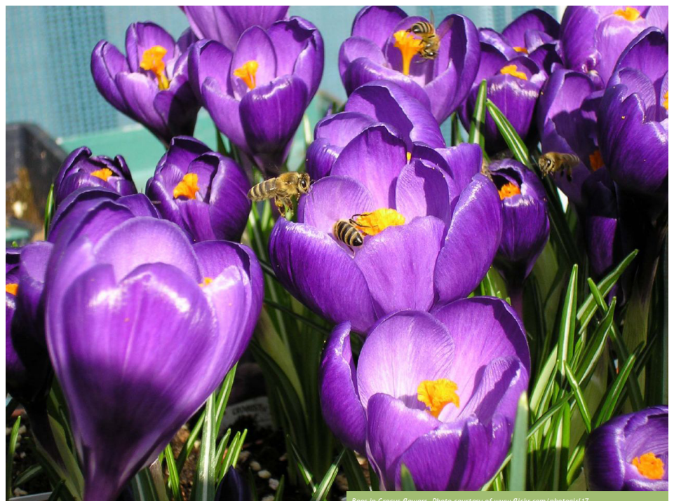
Bees in Crocus flowers.

What is of paramount importance is that with a Landscape Auction you are guaranteed a sustainable investment. Far from a short-term commitment, participants have become stakeholders in safeguarding their own surroundings. With the current gloomy financial crises and lack of trust and certainty among the public, it is the opinion of the authors that it is time to rethink what we really value and how much value we are ready to invest in this. At a Landscape Auction people are confronted with the actual costs of a 'healthy planet' and