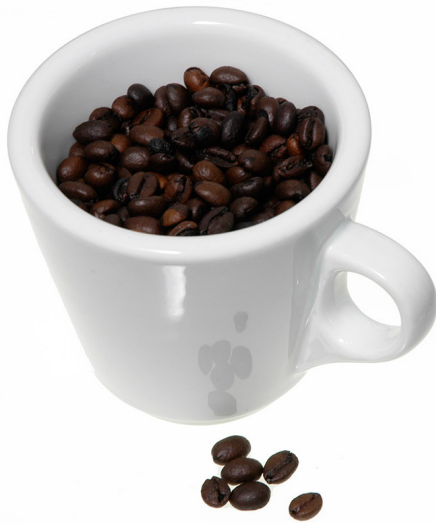
Coffee Arabica.

approach is an exclusionary “fence and fines” approach taken by the Ethiopian government, which designates protected areas and aims at keeping people outside these areas. Lack of financial resources and guarding capacity to control the areas as well as ignorance towards the interests and needs of the local forest users, make it difficult to sustain conservation goals by this approach.