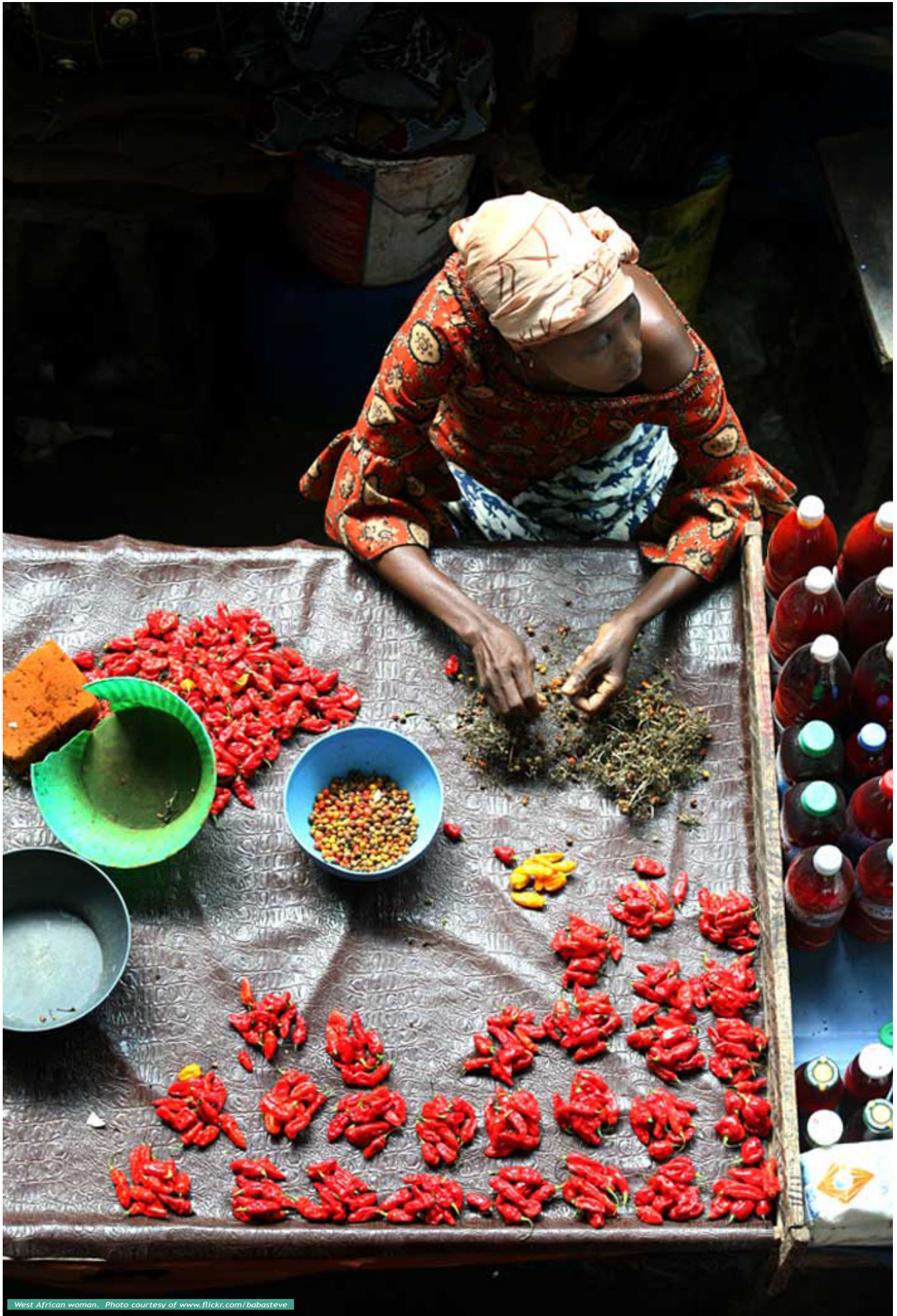
West African woman.