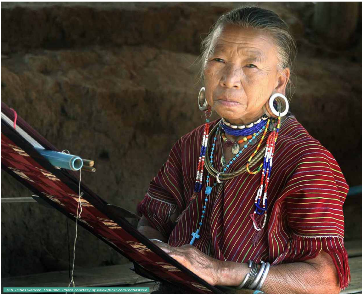
Hill Tribes weaver, Thailand.