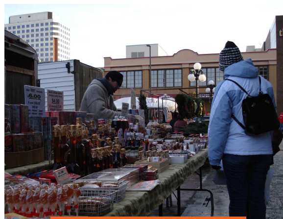
Maple syrup vendor.