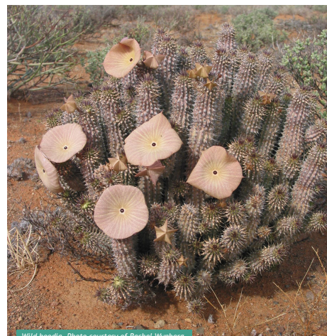
Wild hoodia.

For further information please see the latest relevant notifications at https://www.cbd.int/abs/notifications.shtml or contact directly the Secretariat at secretariat@cbd.int .