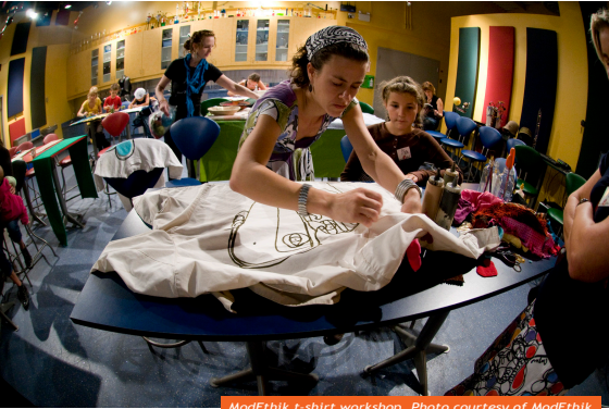
ModEthik t-shirt workshop.

E thical fashion: Fashion that strives for a better world, a world which respects mankind, the environment, and the skills inherent to each culture. - www.ethicalfashionshow.com