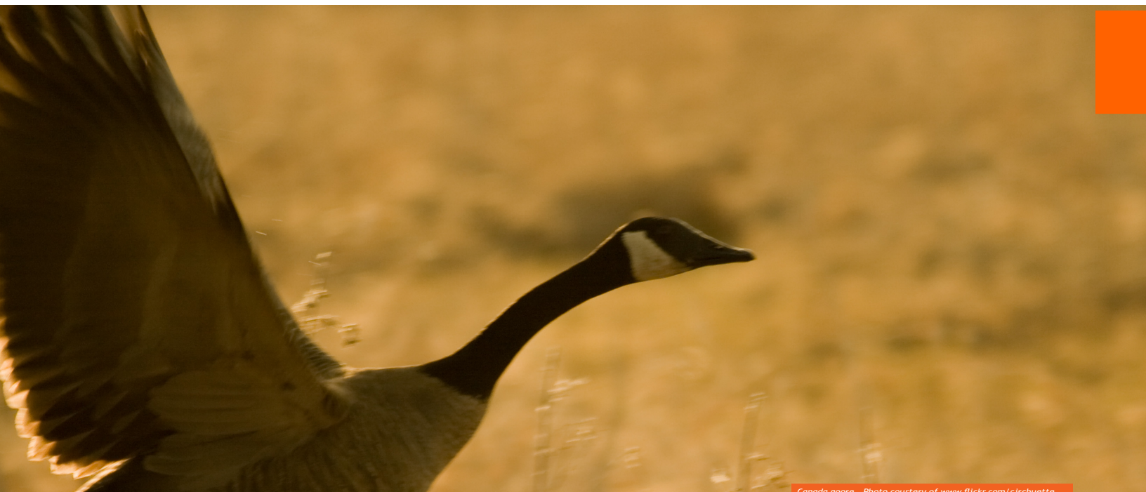
Canada goose.