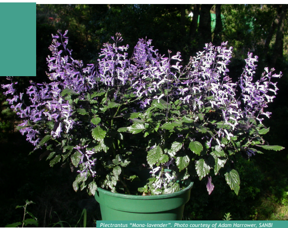
Plectranthus "Mona-lavender".