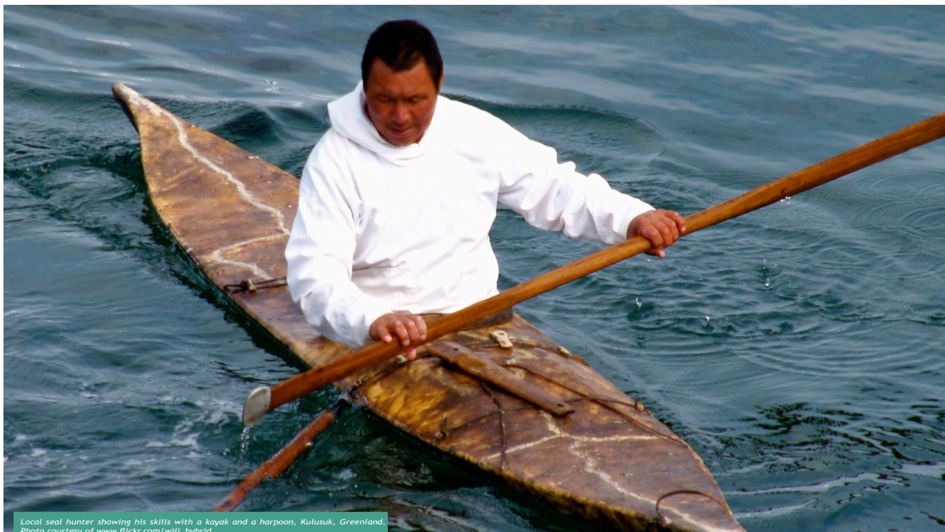
Local seal hunter showing his skills with a kayak and a harpoon, Kulusuk, Greenland.

AVEDA also promotes indigenous entrepreneurs and sustainable business (based on biodiversity) through various international forums, including the UNPFII, through sponsorship of indigenous representatives and facilitating discussion