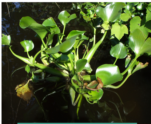
Eichhornia crassipes.