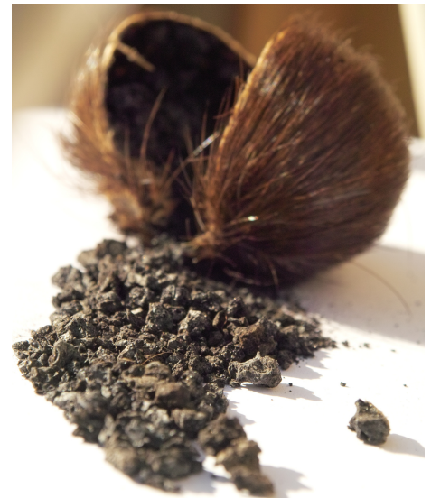
Madagascar Musk Grain from a Musk Pod on sale in Old Cairo, Egypt.