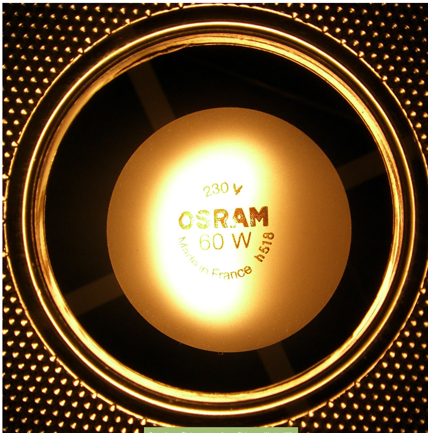
Osram lamp.

The introduction of solar lamp systems at Lake Victoria is a good example of a climate mitigation and biodiversity action which was implemented by an NGO and turned into a viable market-option for private sector companies. In 2004, the Kenyan NGO Osienala and GNF started to look for solutions for the replacement of kerosene lamps that are harmful to health and the environment. The aim was to develop environmentally friendly solar lamps for night fishing of the native Victoria Sardine as the mineral oil used in the conventional kerosene lamps consistently pollutes the lake and drinking water. The bulb producer OSRAM contributed to the NGOs efforts by providing fishermen at Africa's largest lake with off-grid lighting with financial support and technical expertise. Following a one year planning stage, a solar power service station - a so called Energy Hub - was installed. Three further Energy Hubs in Kenya and Uganda will soon be launched. The OSRAM project lamps are rugged, water resistant and significantly cheaper to use than conventional kerosene lamps. The batteries can also be used for radios or recharging cell phones. The demand is huge, with approximately 160,000 night fishermen living on the shores of Lake Victoria. The technique is transferable to other regions in Africa and Asia and can also be used for lighting homes 1 .