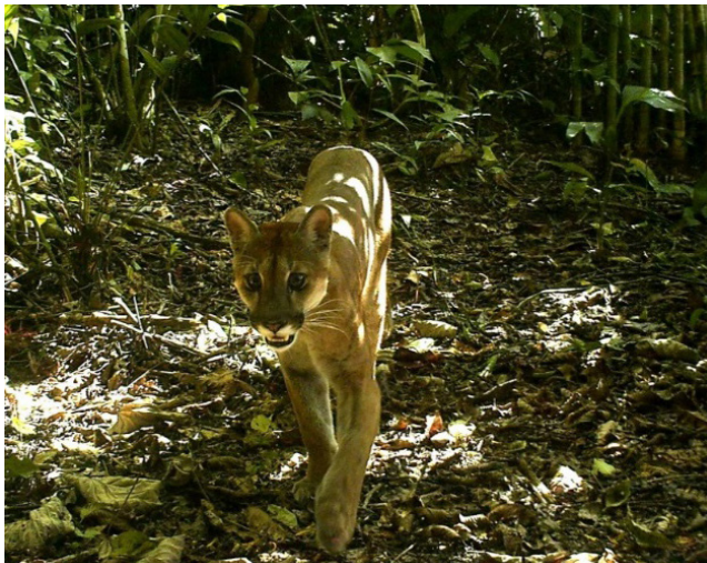
Figure 2. Puma ( Puma concolor )

Wild cats were a group of particular interest, and the PMB was able to obtain 33 photographs over the four month survey period. Seven photographs were of pumas ( Puma concolor ) and 26 were of jaguars ( Panthera onca ). Jaguars are categorized as having global threat status (Near Threatened) by the IUCN. They are the largest wild cat in the Americas and are threatened due to habitat loss and hunting. PMB scientists were able to identify three individual jaguars by examining the pattern of their spots. This likely indicates the presence of a healthy population of jaguars in the vicinity of the natural gas plant which hopefully will be confirmed in future studies.