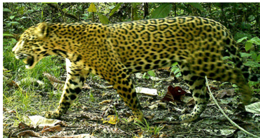
Figure 3. Spot patterns of three jaguar individuals ( Panthera onca )

The appearance of species sensitive to human presence, like the giant armadillo, pumas and jaguars, indicates that there are few impacts and disturbance to wildlife in the area surrounding the plant. This is very good news! Over the next few years, the PMB will continue to monitor wildlife in the area of the plant and propose management actions to assist in their conservation.