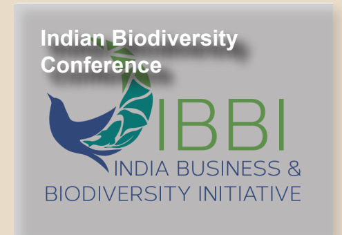
Indian Biodiversity Conference