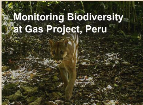
Monitoring Biodiversity at Gas Project, Peru