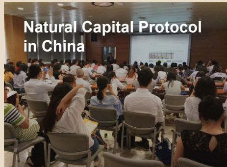
Natural Capital Protocol in China