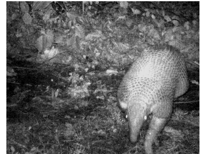
Figure 1. Giant armadillo ( Prionates maximus )