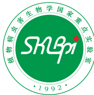
State Key Laboratory for Biology of Plant Diseases and Pests, China