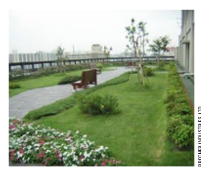
"A green roof on BROTHER INDUSTRIES, LTD." Mizuho Ward, Nagoya City, Japan

Cities and local authorities and their partners have a major role to play in promoting the positive impacts of integrating biodiversity into urban planning and development. Already, as