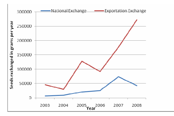
Figure 3.1. Seeds exchanged at national level and exportation from the Latin American Seed Bank at CATIE for S.macrophylla . Information provided by the Latin American Seed Bank.

Figure 3.2 Seeds exchanged at the national level and exportation in the Latin American Seed Bank at CATIE for C.odorata . Information provided by Latin American Seed Bank.