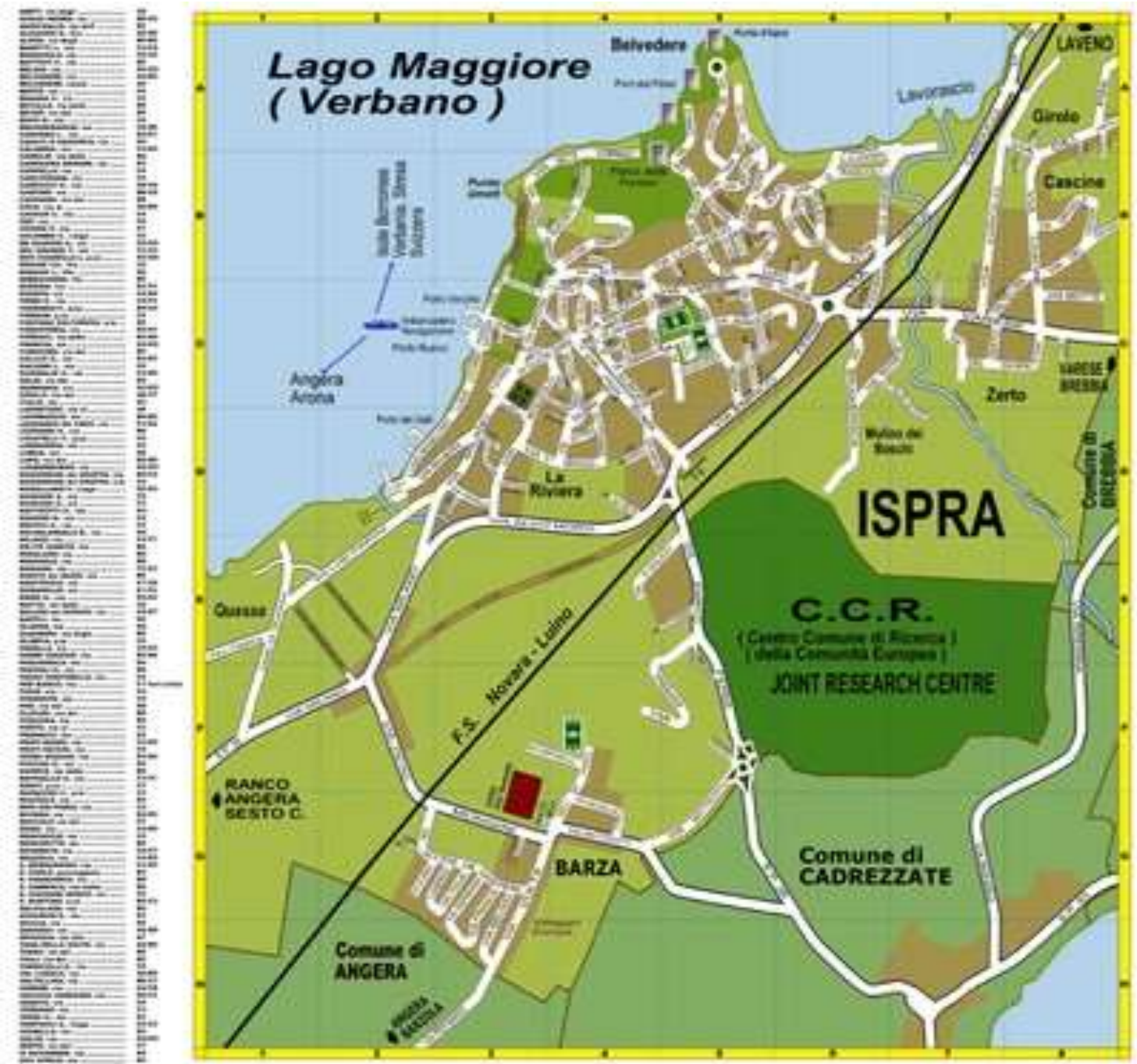
Annex C - Map of the meeting venue, Ispra, Italy