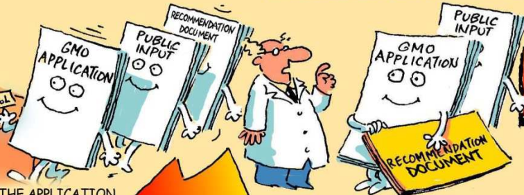
A RECOMMENDATION DOCUMENT IS PREPARED BY THE ADVISORY COMMITTEE