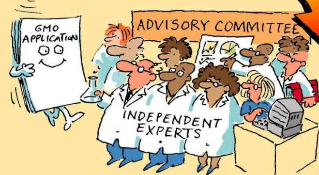
THE APPLICATION IS EVALUATED BY THE ADVISORY COMMITTEE. ADDITIONAL INFORMATION MAY BE REQUESTED FROM THE APPLICANT