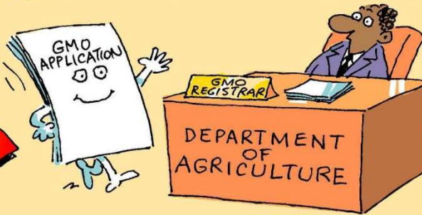
THE GMO APPLICATION IS SENT TO THE REGISTRAR FOR GMO'S AT THE DEPARTMENT OF AGRICULTURE