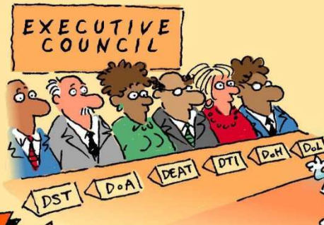
THE EXECUTIVE COUNCIL EVALUATES THE APPLICATION, TAKING INTO CONSIDERATION THE RECOMMENDATION FROM THE ADVISORY COMMITTEE AND PUBLIC INPUT