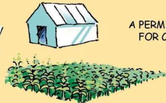
A PERMIT MAY BE ISSUED FOR CONTAINED USE...