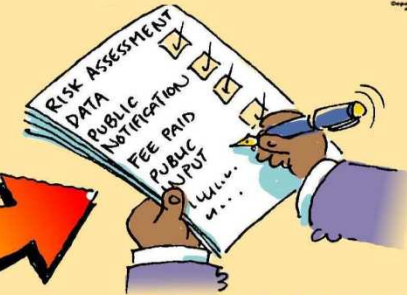
THE REGISTRAR CHECKS TO SEE IF THE APPLICATION MEETS THE REQUIREMENTS OF THE GMO ACT