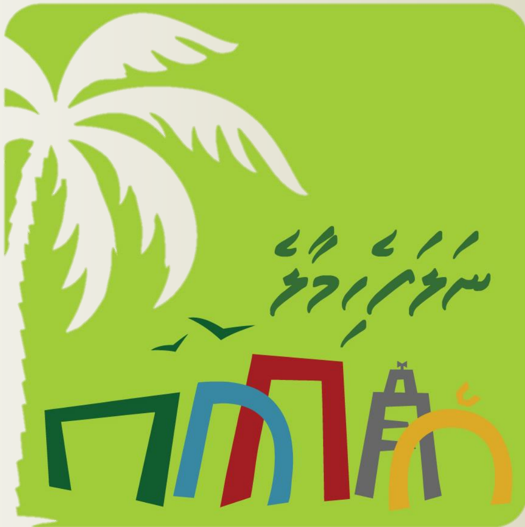
Logo of the campaign to make Male' City greener and cleaner, a citywide initiative by Male' City Council in collaboration with private partners