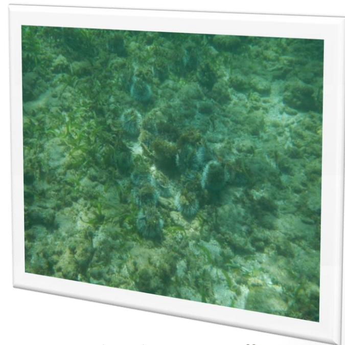
Sea Urchins & Sea Grass off Maria Is.