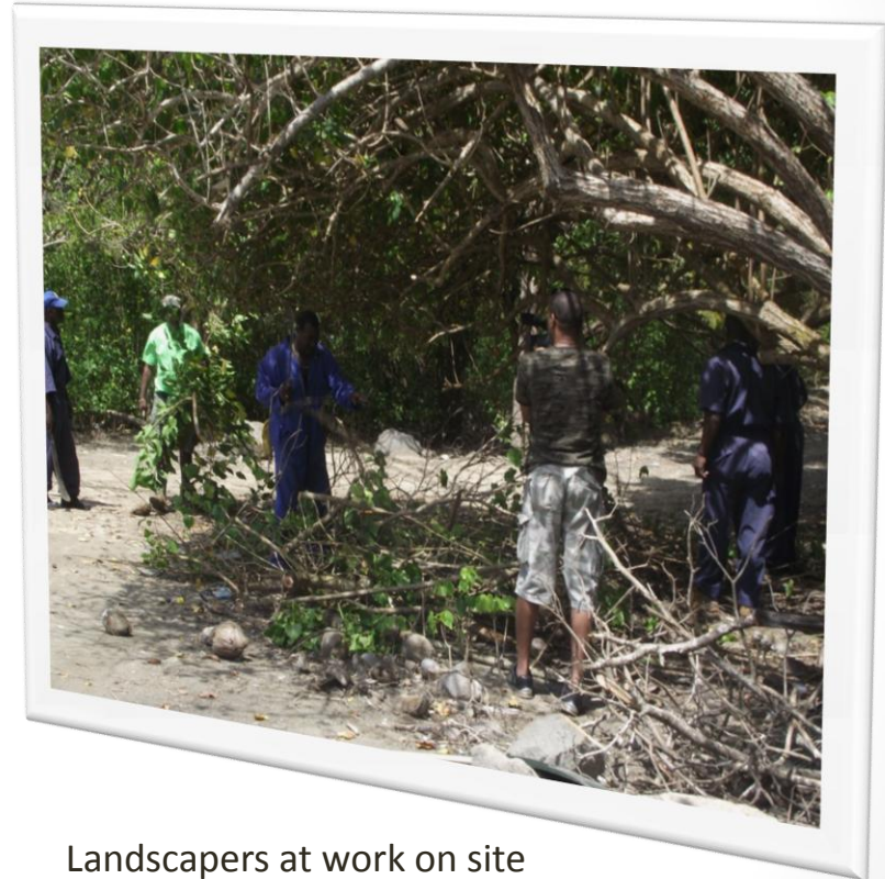
Landscapers at work on site