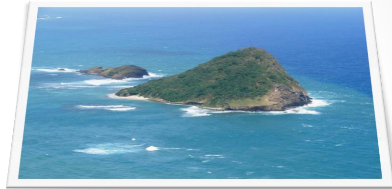
The Maria Islands