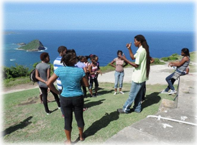
Presentation at Youth Env. Forum