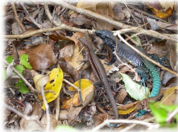
Saint Lucia Whiptail