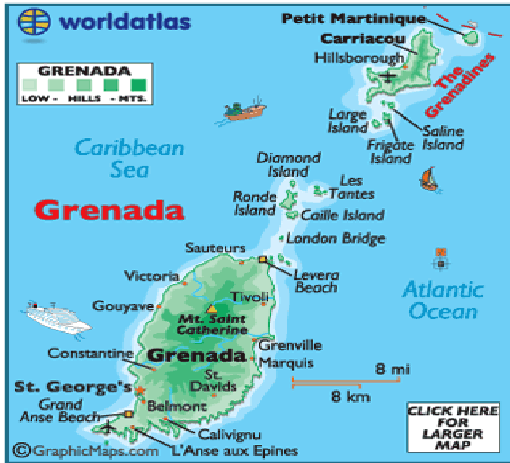
Fig.1. Map of the State of Grenada