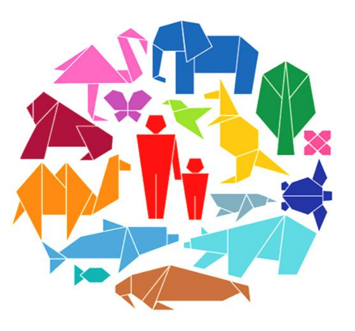
Life in harmony, into the future

In Decision X/10, COP 10 decides that 5NR should: