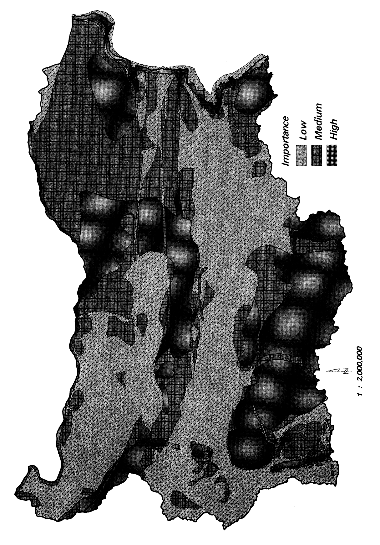
MAP 4. RARE TAXA

Categories of importance for rare taxa reflect composite rankings based on assessments of the known or estimated number of rare taxa or the value of an area in terms of rare taxa.