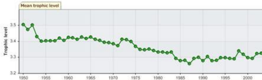
Figure 2. Mean trophic level (i.e., Marine Trophic Index) in the Bay of Bengal LME (Sea Around Us 2007, UNEP LME Report 2008).