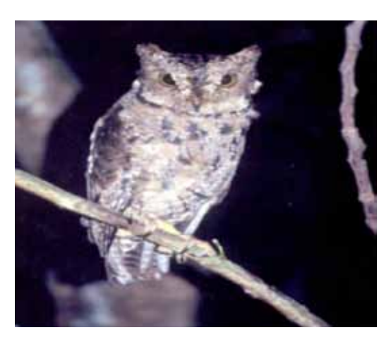
Seychelles Scops Owl (Syer)