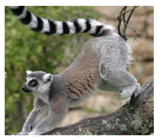
Ring-Tailed Lemur of Madagascar

10. In the West Indian Ocean islands such as Madagascar, there are five bird families and five primate families that live nowhere else on Earth. Madagascar's 72 lemur species and subspecies serve on the global stage as the island's charismatic ambassadors for conservation, although – tragically - 15 species have been driven to extinction (Conservation International, Biodiversity Hotspots 2007). The Seychelles and Comoros islands in the Indian Ocean also support a number of critically endangered bird species. For example, the Seychelles Scops Owl (Syer) is evaluated as Critically Endangered on the IUCN Red List, due to habitat loss and limited range in some areas (IUCN Red List, 2008).