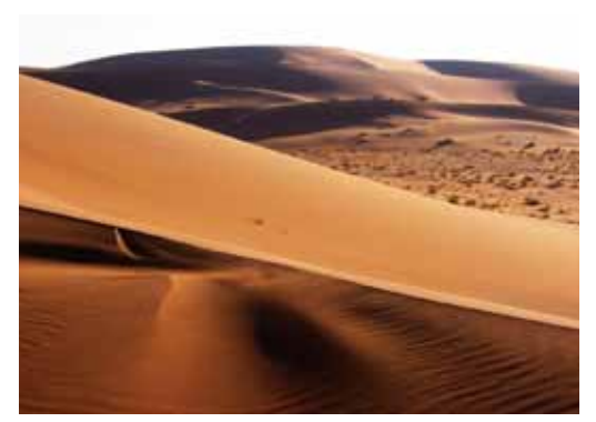
Namib Desert, Namibia

25. In the Sahara desert, wildlife habitats have been heavily altered by human activities, as previous tree cover has been removed for fuel and fodder by pastoralist communities and traders. Some factors are conspiring to make conditions yet more difficult for these plants. Some localities have been overstocked with domestic animals, especially around waterholes or wells. The deserts of Namibia boast rich succulent flora and an exceptional plant endemism – 69 per cent of its plants are found nowhere else on Earth – together with unique reptile species. The effects, however, of grazing, agriculture and mining, the fragmentation of wildlife habitats by roads, the illegal exploitation of reptiles and other human activities are threatening this fragile desert (Global Desert Outlook, 2006).