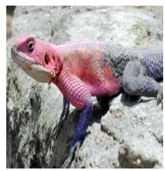
Red-headed Rock Agama (Lizard)

13. African forests support many wild vertebrate species, such as chimpanzees, Jentink's duiker, mandrills and the pygmy hippopotamus, that are threatened or in danger of extinction. The lowland forests of West Africa are home to more than one quarter of Africa's mammals, including more than 20 species of primates. As many as six species are endemic to the Upper Guinea forests, and nine are endemic to the forests of Cameroon and Nigeria. The mandrills are the world's largest monkeys and can claim to be the most colourful of all mammal species. They live in the rainforests of the Congo