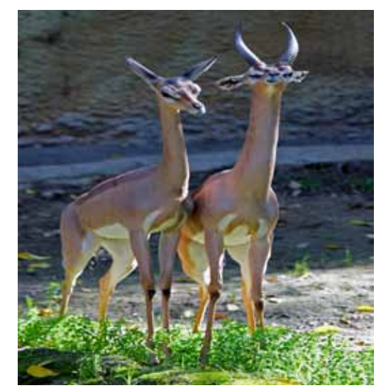
Gerenuk (Litocranius walleri)