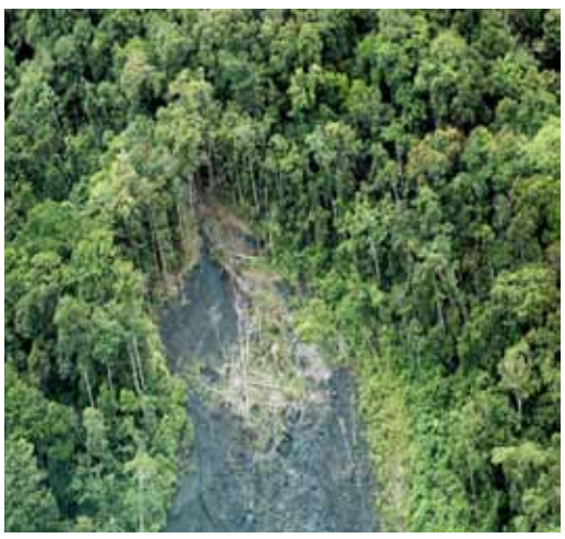
Mau Forest, Kenya

(Source: UNEP Annual Report 2009 and Kenya Wildlife Service Annual Report 2008).