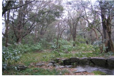
Honmaru Garden in Kanazawa Castle Park

vegetation close to its natural state. There was a rapid increase in vegetation cover after the war, when Kanazawa University was relocated to the former castle grounds. Even now, the number of plant species in this area of the park exceeds 500.