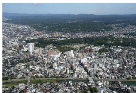
Green areas in the city

Kanazawa's policies have played an important role in protecting Honda Forest Park, Kanazawa Castle, Kenrokuen and other green areas in the city center from development and in maintaining the continuity of the green corridors that link them with the river terraces bordering the Teramachi and Kodatsuno Plateaus, and further to satoyama areas and to the mountains of Iozen and Naradake,