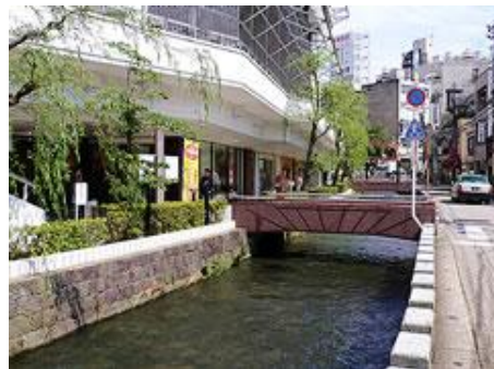
The uncovered channel of the Kuratsuki Canal

With regard to biodiversity management in water environments, the artificial stream built along the Hakuchoro promenade on the eastern side of Kanazawa Castle Park has been successful in attracting insects and other aquatic species. Since firefly nymphs were released for the first time in 1987, fireflies have been occurring naturally around the stream, reaching a current population of about 100. A diversity of firefly habitats have been restored around the city, and watching the glowing insects as they fly over the Onosho Canal in the Nagamachi samurai district has become a favorite scene of early summer evenings.