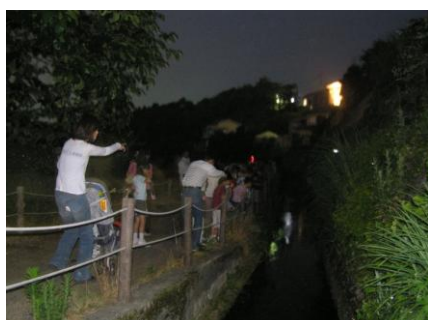
Firefly observation at Tatsumi Canal

The diversity of Kanazawa's environment, which ranges from okuyama and satoyama to intra-urban green areas and coastal areas, provides opportunities for a variety of interactions with nature. At the same time, local government initiatives intended to conserve and develop this rich environment have also been undertaken in the form of participatory projects, aiming to sensitize residents to environmental issues and to engage them in the preservation of biodiversity.