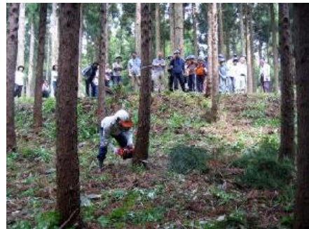
Forest management activities by Kanazawa City College of Forestry

The City has provided specific assistance targeted at the regeneration of aged broadleaf forest and management of degraded bamboo forests. To ensure efficient use of forest thinnings, wood thinned from Kanazawa's managed forests has been used to refurbish classroom walls and other public facilities.