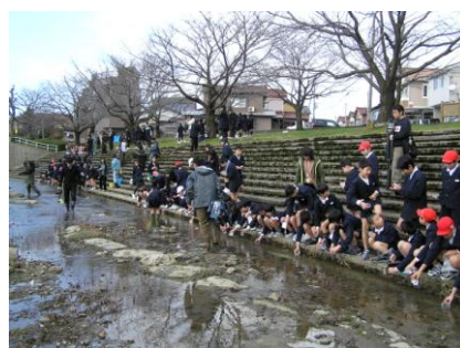
Release of young salmon in Kanazawa's rivers

Another participatory project carried out since 1989 is the release of juvenile salmon reared by elementary school students into nearby rivers. To facilitate upstream migration of salmon during spawning season, the Fushimi River, which runs through several residential areas, has been equipped with fishways. In 2009, 16 elementary schools participated