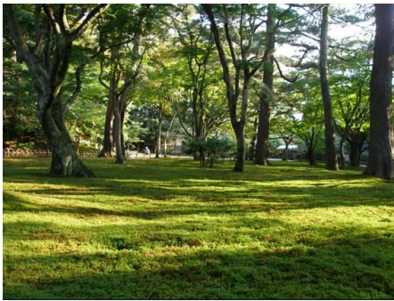
Moss in Kenrokuen

In contrast, Kenrokuen was created as the manmade garden of a feudal lord and relies on human management. Nevertheless, the fact that the garden design incorporates a large proportion of native vegetation has caused some of its areas to become close to that of natural forests over time. Research conducted in Kenrokuen has identified habitats for over 100 bryophyte (moss) species, an extremely high number even when compared with other Japanese gardens. It has been suggested that the