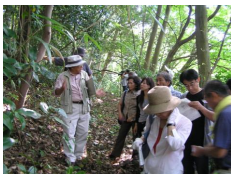
Nature observation in Honda Forest Park

In particular, Honda Forest Park is characterized by a high degree of naturalness, containing multiple layers of vegetation, from tall trees such as tabu ( Machilus thunbergii ) and sudajii ( Castanopsis sieboldii ) and a sub-tree layer represented by yabutsubaki ( Camellia japonica ) to himeaoki ( Aucuba japonica var. borealis ) and other shrubs. Surveys have shown that the park provides habitats for numerous species of birds and other fauna. On summer mornings and late afternoons from the beginning of July till August, the song of higurashi cicadas resonates in the city, creating characteristic soundscapes. In 1996 the song of the higurashi of Honda Forest Park was selected together with the sound of the bells in the Teramachi temple district as one of the Top 100 Japanese Soundscapes to Be Preserved .