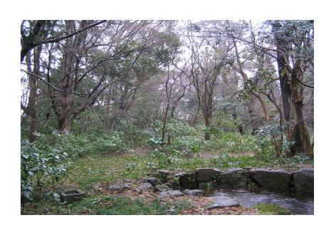
Honmaru Garden in Kanazawa Castle Park

As in the case of Honda Forest Park, the Honmaru Garden in Kanazawa Castle Park also contains vegetation close to its natural state. There was a rapid increase in vegetation cover after the war, when Kanazawa University was relocated to the former castle grounds. Even now, the number of plant species in this area of the park exceeds 500.