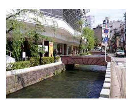
The uncovered channel of the Kuratsuki Canal

On the other hand, consideration of ecological factors when carrying out watercourse improvement works has increased the suitability of rivers and canals as habitats for various species. Upstream migration of salmon has been observed in the city's rivers. Once uncovered and rehabilitated, the canals do not just add to the attractiveness of the city and to the quality of life of its