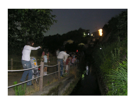
Firefly observation at Tatsumi Canal

The diversity of Kanazawa's environment, which ranges from okuyama and satoyama to intra-urban green areas and coastal areas, provides opportunities for a variety of interactions with nature. At the same time, local government initiatives intended to conserve and develop this rich environment have also been undertaken in the form of participatory projects, aiming to sensitize