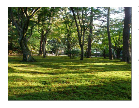
Moss in Kenrokuen

In contrast, Kenrokuen was created as the manmade garden of a feudal lord and relies on human management. Nevertheless, the fact that the garden design incorporates a large proportion of native vegetation has caused some of its areas to become close to that of natural forests over time. Research conducted in Kenrokuen has identified habitats for over 100 bryophyte (moss) species, an extremely high number