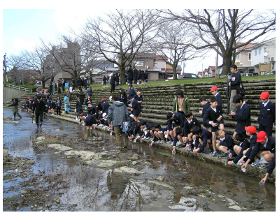
Release of young salmon in Kanazawa's rivers

Another participatory project carried out since 1989 is