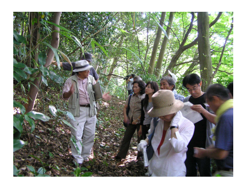
Nature observation in Honda Forest Park

In particular, Honda Forest Park is characterized by a high degree of naturalness, containing multiple layers of vegetation, from tall trees such as tabu (Machilus thunbergii) and sudajii (Castanopsis sieboldii) and a sub-tree layer represented by yabutsubaki (Camellia japonica) to himeaoki (Aucuba japonica var. borealis) and other shrubs. Surveys have shown that the park provides habitats for numerous species of birds and