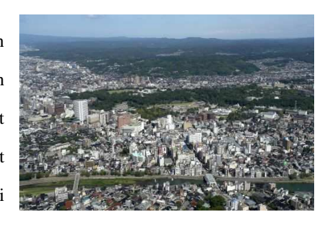
Green areas in the city

Kanazawa's policies have played an important role in protecting Honda Forest Park, Kanazawa Castle, Kenrokuen and other green areas in the city center from development and in maintaining the continuity of the green corridors that link them with the river terraces bordering the Teramachi and Kodatsuno Plateaus, and further to satoyama areas and to the mountains of Iozen and Naradake,