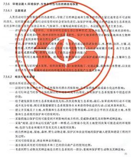
Table1 GB/T 36000-2015 Social Responsibility Guideline having integrated biodiversity