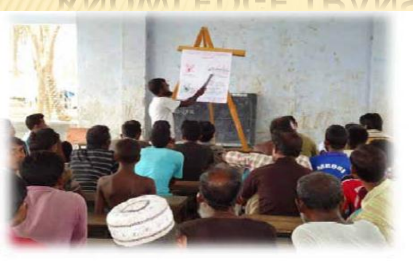
Figure: Experienced Resource Collector (community member) is Conducting Training at 4 No. Koyra