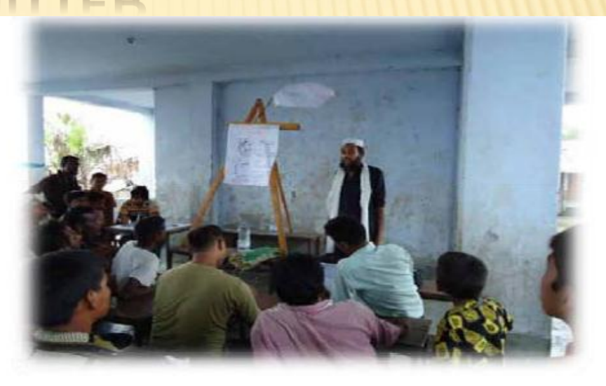
Figure: Religious leader is informing the local community regarding customary rules of resource collection