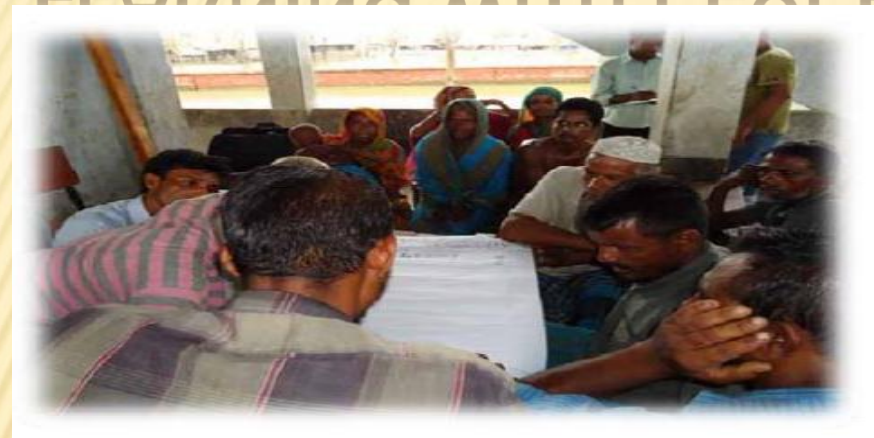
Figure: Experienced resource collectors are preparing vulnerability map at 4 No. Koyra