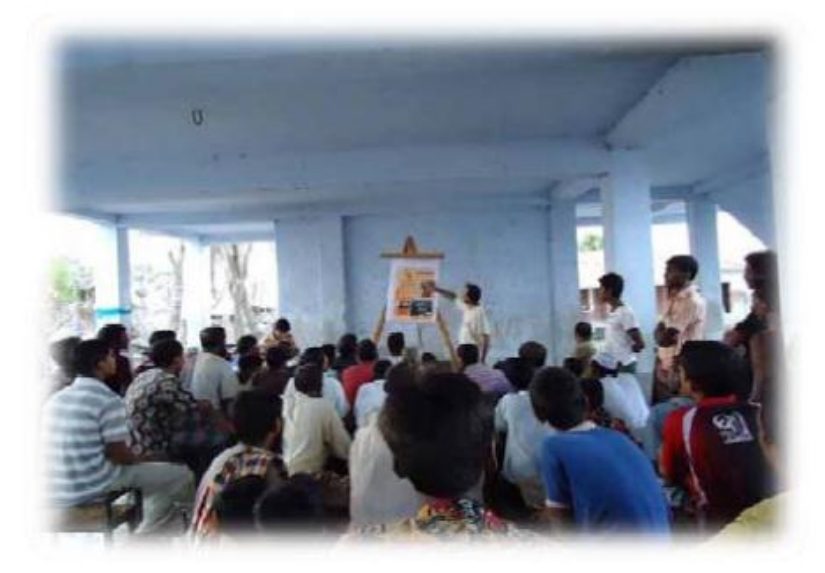
Figure: Community people is being informed about traditional fishing system of Nicaragua