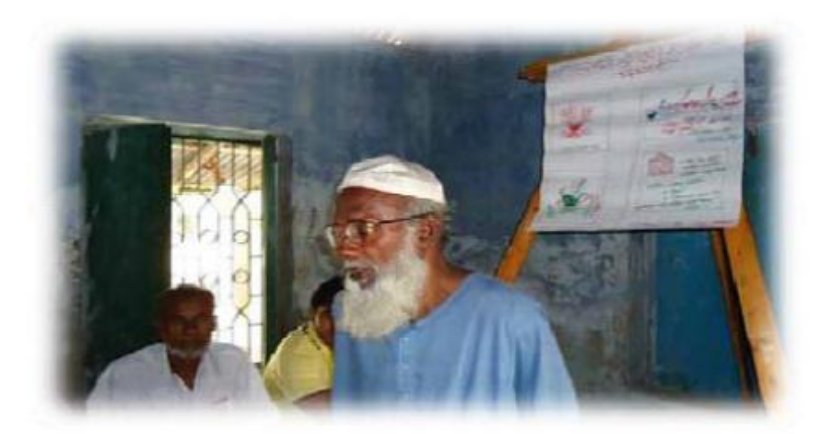
Figure: Experienced Goalpata collector is conducting training to young collectors at Naksha village