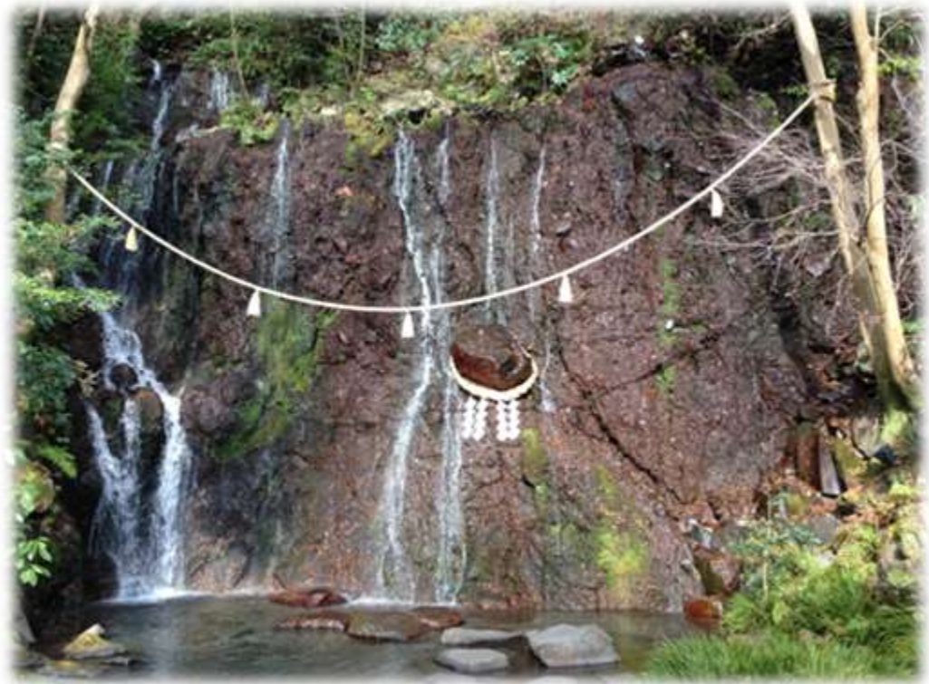
Worship site for nature in Japan