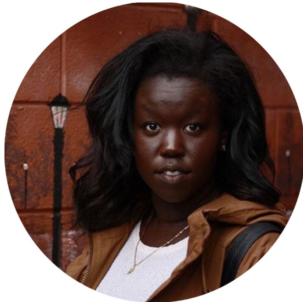
Coordinator, Diverse and Inclusive Outreach and Engagement CEC