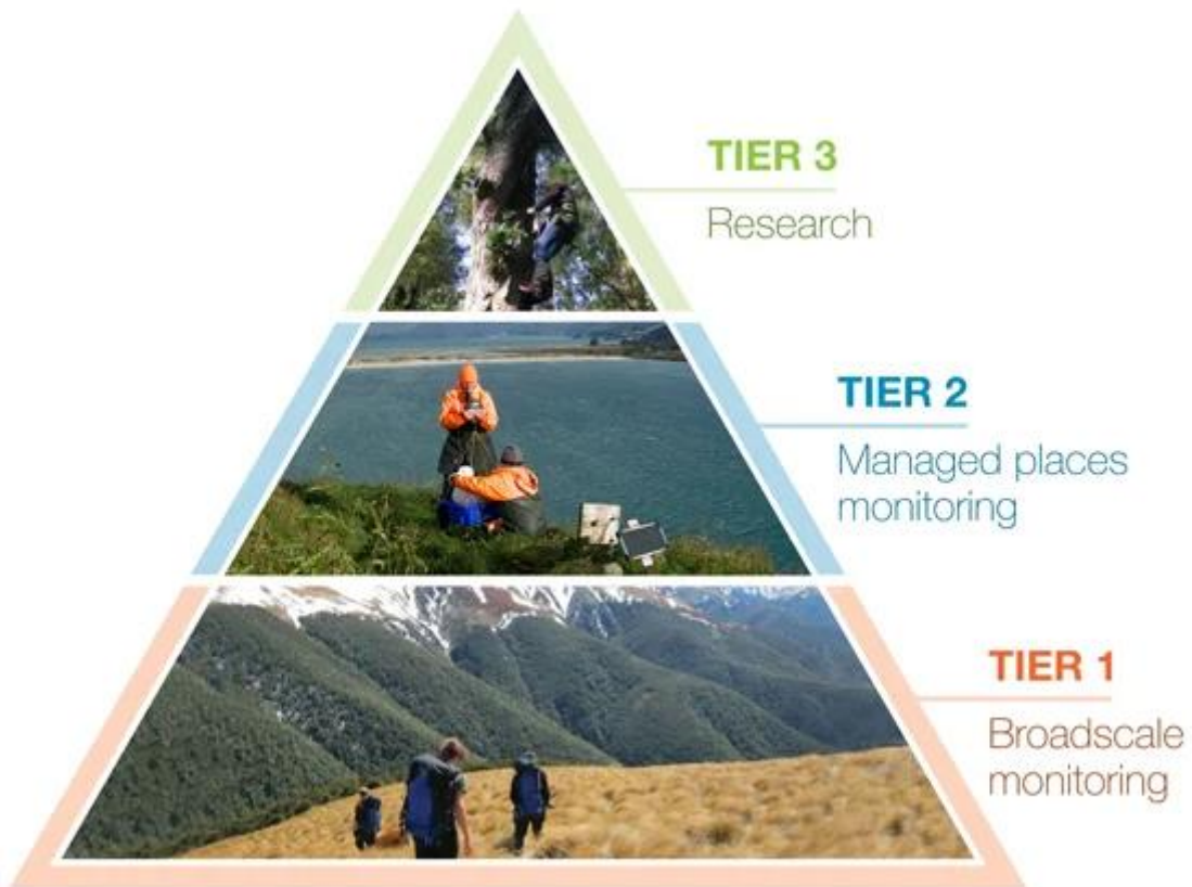
Figure A1. The tiers of biodiversity information.

Biodiversity monitoring supplies data from different tiers of biodiversity information focused on distinct priorities (Figure A1). Tier 1 includes the vast amount of data collected from broadscale monitoring from public, unstructured and local knowledge sources. Tier 2 consists of information based on data collected consistently from more focused national monitoring systems involving managed species and ecosystems. Tier 3 consists of information based on data collected from intensive monitoring for research purposes and is capable of delivering the detailed information required to manage, maintain and restore biodiversity. These tiers of information are exemplified in New Zealand’s Department of Conservation Biodiversity Monitoring and Reporting System 7 and serve to provide comprehensive information about biodiversity across the national scale.