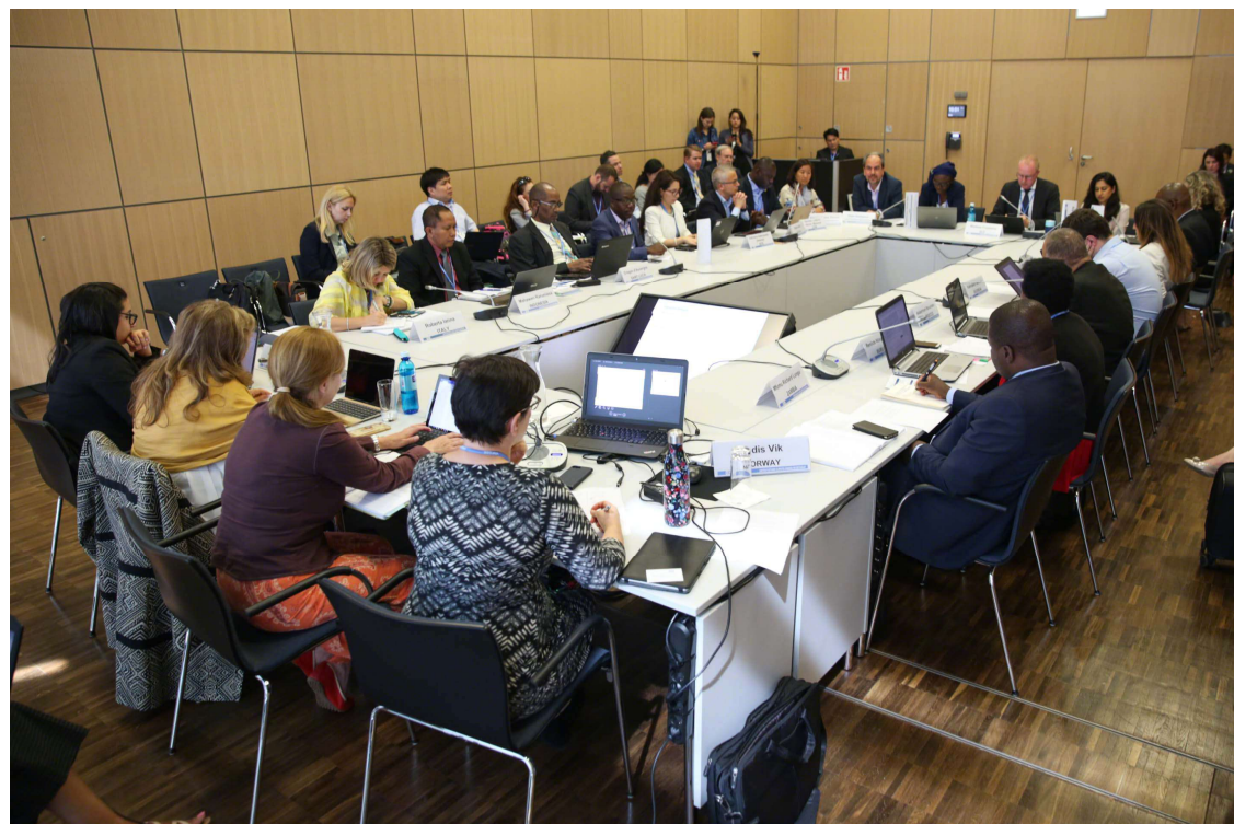
World Conference Center, Bonn, Germany | June 2019