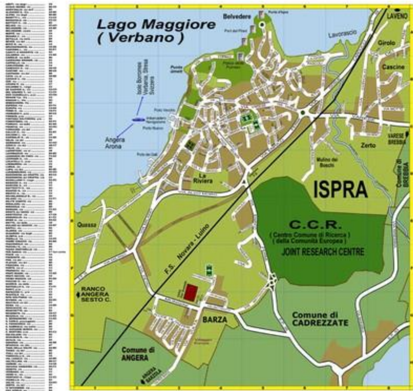
Annex C - Map of the meeting venue, Ispra, Italy