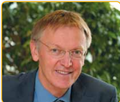
Janez Potočnik EU Commissioner for the Environment

Biodiversity is our life insurance, giving us food, fresh water and clean air; recreation, shelter and medicine, preventing natural disasters and contributing to combatting climate change. Put in a simple way, we have to protect biodiversity because it is the right and ethical thing to do, but also because it is in our own self-interest.