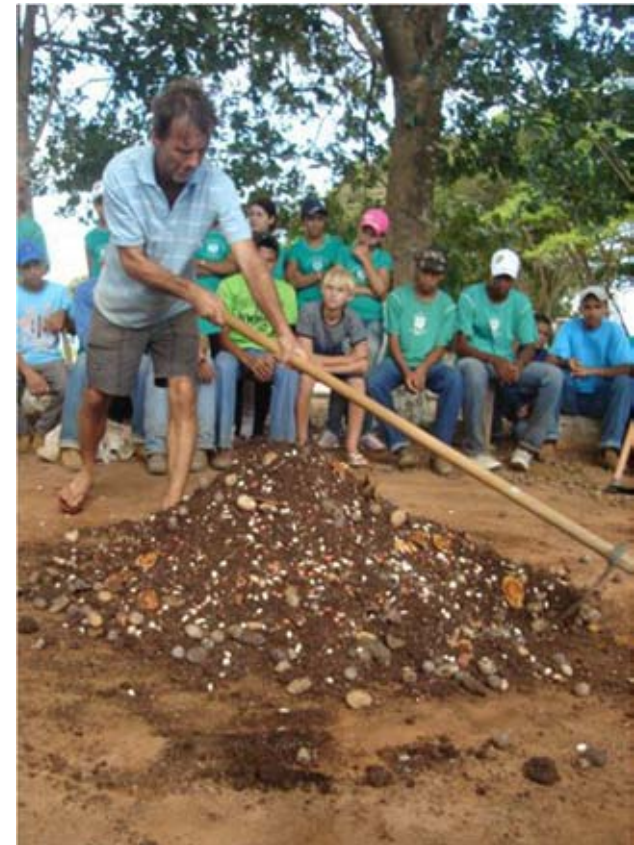
Preparing seed for direct seeding.