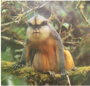
Bioko Crowned Monkey