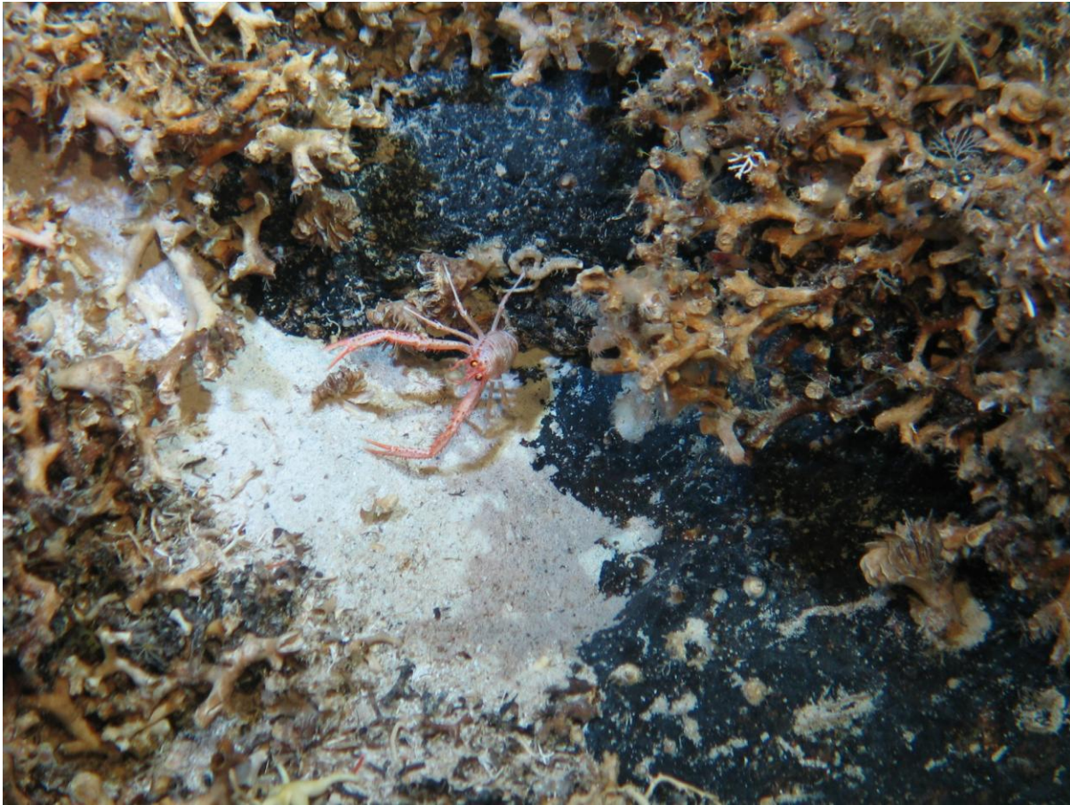
Figure 3. Squat lobster, Coral Seamount, cold-water coral reef.

Please note that this template is provided to facilitate information submission on a voluntary basis, only when the information provider finds this template appropriate. If the available information does not fit the format of this template, information can be submitted in another format, in consultation with the Secretariat.