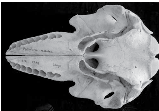
Fig. 6. Skull of a false killer whale. Nine round tooth sockets arranged along full length of rostrum, wide premaxilla bones and deep antorbital notches aided the identification of this specimen.

Records suggest that the false killer whale is a breeding resident in the Gulf of Oman (Baldwin et al. , 1999; Leatherwood et al. , 1991). A sighting reported by Leatherwood et al. (1991) at 25.85°N 59.85°E is incorrectly located 30 miles inland in Iran, however the sighting itself may still be valid. One false killer whale skull stored at IFRO in Chabahar (Fig. 6), and collected from the nearby coast, suggest it is present in Iranian waters of the Gulf of Oman.