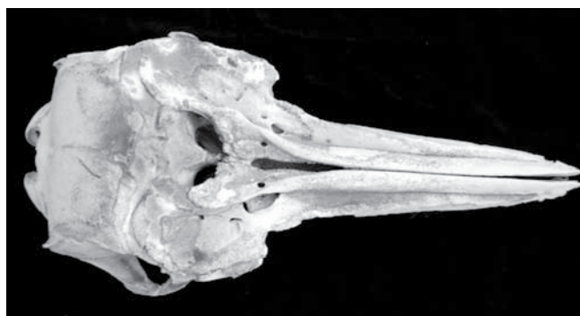
Fig. 4. Skull of rough-toothed dolphin, stored in the IFRO museum in Chabahar. The skull was identified based on the large orbit, number of teeth and the ridge at the ventral side of the frontals.

The complete skull of a mature rough-toothed dolphin is stored at the IFRO office in Chabahar (Fig. 4). This is the first, and only, record of this species in Iran. This species has not been recorded in Pakistan but it has been recorded (both sightings and strandings) a hand-ful of times in Omani waters of the Gulf of Oman (Ballance and Pitman, 1998; Van Waerebeek et al. , 1999; Oman Whale and Dolphin Research Group, unpublished data). There is no evidence of rough-toothed dolphin occurrence in the Persian Gulf and it is unlikely that this is suitable habitat for this deep water species (Robineau, 1998).