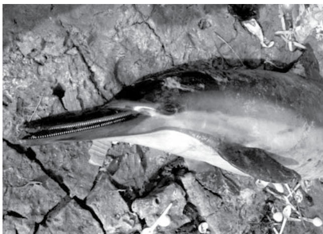
Fig. 3. Long-beaked common dolphin, D. c. tropicalis , stranded near Bushehr. The extremely long rostrum, high tooth count, flipper to jaw stripe and hourglass pattern on the flanks are diagnostic.

In Iranian waters of the Persian Gulf, one group of 12 common dolphins were recorded in offshore waters in the northwest (Henningsen and Constantine, 1992). No specific location for this sighting was given, but the survey track indicates that the sighting must have been SSW of either Bushehr city, or Ganaveh. A young bycaught animal stranded near Bushehr city in November 2007, and two animals, a 203cm male (Fig. 3) and 186cm female, were bycaught near Ameri, Bushehr in February 2008 (Table 1). A D.c. tropicalis skull is stored at the GeoPark Museum on Qeshm Island.