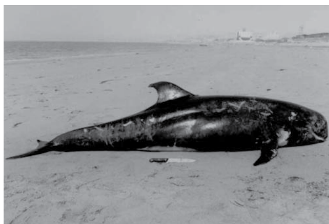
Fig. 5. Stranded Risso's dolphin, close to Chabahar. This species is identified based on the white patch on the chest, white lips, blunt head, dark colouration with white scarring and tall falcate dorsal fin.

Knowledge of this species in the northwest Indian Ocean is very limited and although there is a well documented record from Hallaniyah, Oman, there are no confirmed sightings in the Persian Gulf or Gulf of Oman (Baldwin et al. , 1999; Van Waerebeek et al. , 1999). The ease of confusion with other