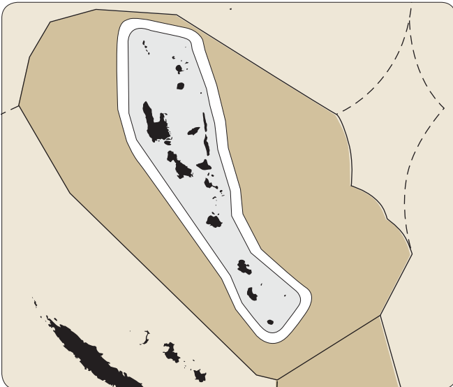
Figure 2. A portion of Vanuatu's EEZ, and the 12- and 24-mile zones.