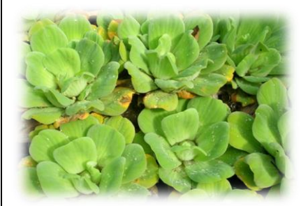
Water Letes - Water lettuce - Pistia stratiotes

A significant pest of freshwater bodies that is currently being effectively controlled by a biocontrol agent