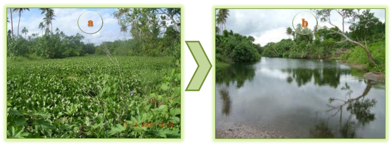
Figure 9: (a) Teouma stream infested with water hyacinth -2004, (b) teouma stream after release of water hyacinth weevils -2008