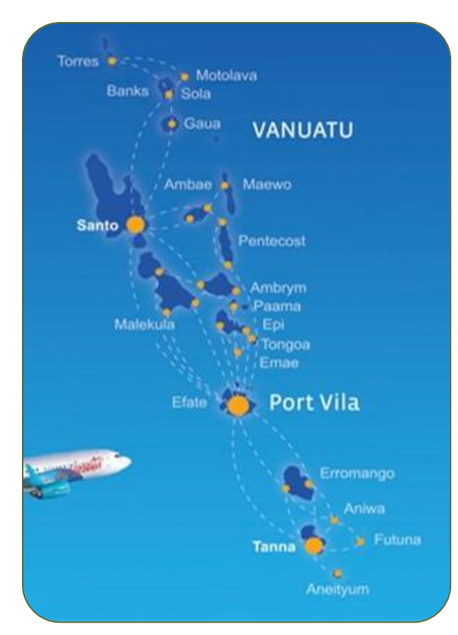
Figure 8: Air Vanuatu domestic flight routes. (http://www.airvanuatu.com/home/plan-book/route-map.aspx)