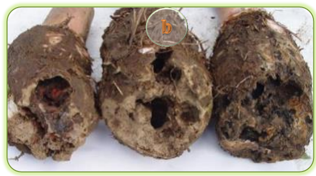
Figure 3: (a) Taro beetle and (b) taro beetle damage

Out of the twelve species of fruit flies present in Vanuatu, only three are known to attack cultivated economic fruit and vegetable crops. These includes Bactrocera trilineola (photo) which in the region is only found in Vanuatu where it occurs on all the islands and infests 95% of ripe guavas, 64% of ripe Malay apples and 11% of ripe mangos (SPC database); Bread fruit fly ( B. umbrosa ) which is also present in all the islands and B. quadrisetosa which is a minor pests of only Pacific lychee. The arrival of other species, e.g. Queensland fruit fly ( Bactrocera tryoni ) would be very damaging, e.g. halting Tahitian lime exports to NZ.