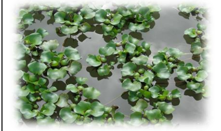
Water Haisin - Water Hyacinth - Eichornia crassipes

A significant pest of freshwater bodies that is currently being effectively controlled by a biocontrol agent.