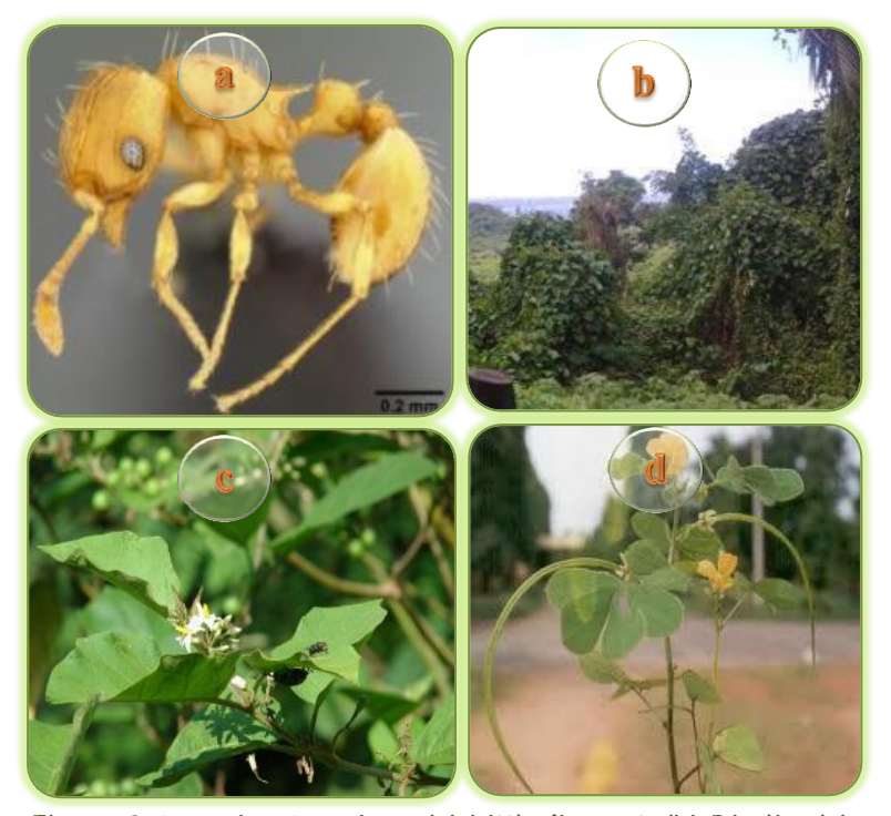
Figure 2: Invasive Species - (a) Little fire ant, (b) Big liv, (c) Wan dei rope and (d) wild peanut (piko).

The little fire ant has been described as 'perhaps the greatest ant species threat in the Pacific region' (GISD 2014). It was first detected in Vanuatu on Vanua Lava in the northern Banks Group in 1996 and has since spread to other islands in that group, and to Santo and Efate. These ants occupy gardens and homes in large numbers frequently stinging the residents, particularly young children, and affect crop growth and yield; may also blind domestic cats and dogs. They reduce the numbers of native insects, have led to reductions in reptile numbers, and contribute to the spread of plant diseases. They are already having an impact on tourists visiting the Banks Group and would have major economic impacts for the whole country if they reach the main areas favoured by tourists.