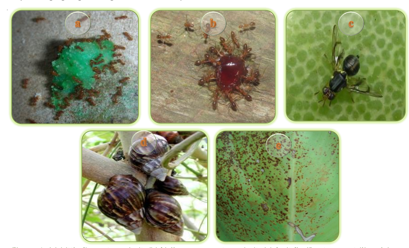
Figure 4: (a) Little fire ants on bait, (b) Yellow crazy ants on bait, (c) fruit fly (Bactrocera trilineola), (d) Giant African snail, and (e) Heliconia leaf attacked by leaf lap-lap rust fungus

Out of the twelve species of fruit flies present in Vanuatu, only three are known to attack cultivated economic fruit and vegetable crops. These includes Bactrocera trilineola (photo) which in the region is only found in Vanuatu where it occurs on all the islands and infests 95% of ripe guavas, 64% of ripe Malay apples and 11% of ripe mangos (SPC database); Bread fruit fly ( B. umbrosa ) which is also present in all the islands and B. quadrisetosa which is a minor pests of only Pacific lychee. The arrival of other species, e.g. Queensland fruit fly ( Bactrocera tryoni ) would be very damaging, e.g. halting Tahitian lime exports to NZ.