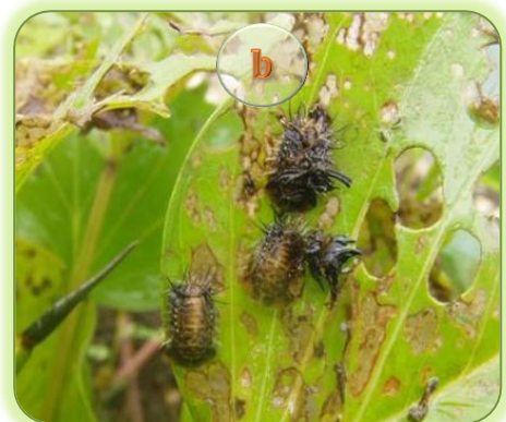
Figure 6: (a) Adult beetles (Aspidormorpha deusta), and (b) larvae destroying leaves; and their discarded 'skins'.

A key part of this strategy will to try to prevent invasive species moving between different islands within the country. It is too late to eradicate many from Vanuatu altogether but we can maybe keep some islands free of them.