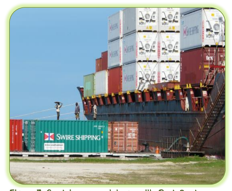
Figure 7: Container vessel, Luganville Port, Santo.

Two ports, Port Vila and Luganville, handle container shipping and are served by several international shipping companies. The outsides of containers can harbour invasive species in addition to their contents. The keys to blocking this pathway are good procedures when filling containers and preparing manifests (lists of contents) at the country of origin and inspecting and fumigating as many as possible on arrival in Vanuatu. Some goods and machinery may be shipped as deck cargo and pose a particular risk. One damaging example that could arrive in containers or used machinery is the Asian honey bee (Apis cerana).