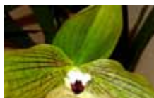
Photo: Bosnia and Herzegovina's action to address invasive alien species (ex. Ragweed, Artemisia artemisiifolia ).

Bulgaria: A national programme of initiatives is featured on the Ministry's website www.moew.government.bg . The main event of the Ministry was conducting a two-day Science