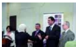
Photo: Featured during COP10, the MERRY PROJECT is an official partner for IYB.

Jordan: A competition was organized among students at schools (including best article and best graphics). There was also a competition for journalists related