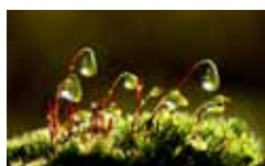
Photo: Latvia's IYB campaign "Moments of biodiversity".

Latvia: The Nature Conservation Agency of Latvia organized the campaign "Moments of biodiversity," which included many guided tours in national parks.