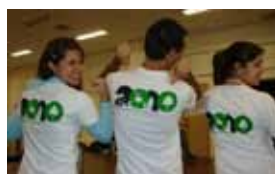
Photo: De Heart uh Barbados 10K run and 5K walk CELEBRATING LIFE ON EARTH 2010.

Brazil commemorated the IYB on the occasion of many international Days (IDB, WED, Health Day, etc.) with events, exhibitions, competitions and activities. One original example