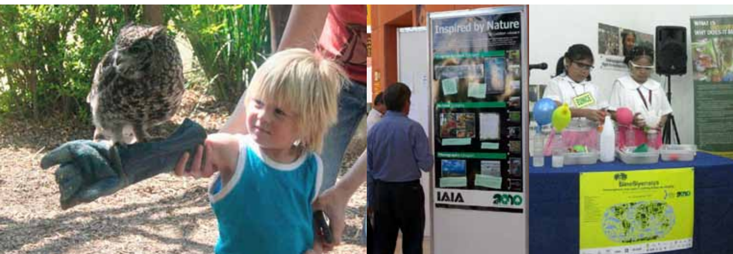
Left: One young patron with a Spotted eagle owl ( Bubo africanus ) perching on his arm. Middle: Featuring winners, runners-up and honorable mentions. Displayed at IAIA conference in Puebla, Mexico. Right: Filipino students perform a science experiment (Science film festival).