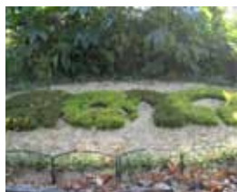
Photo: Catalonia (Spain) awarded a total of € 600,000 to 21 associations and foundations to finance education and awareness-raising activities on climate change.

United Kingdom: The IYB-UK, run by the Natural History Museum, and part funded by Defra, admirably adopted the IYB campaign and promoted it among its 450+ participating organisations and entities across