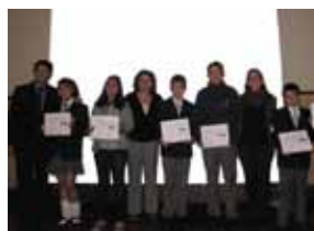
Photo: Biologandos 2010. Universidade Nove de Julho – Uninove.

Chile: The MoE developed a new legal framework for the management of biodiversity. 2010 was also the beginning of the sixth classification process, with more than 400 species classified to date.