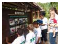
Photo: Auckland schoolchildren.