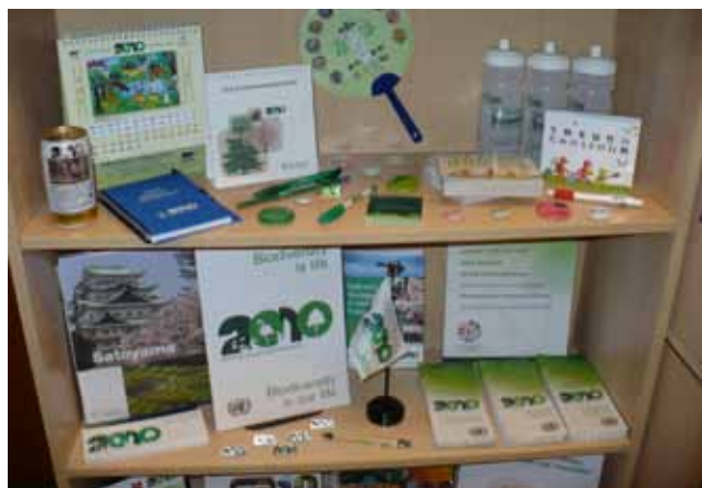
The IYB museum, located at the SCBD, showcases the materials sent by 62 countries and 9 international organisations commemorating the Year

The IYB museum showcases samples of the information materials and promotional items created by governments and organisations. 301 items are currently part of the museum; they have been produced by 62 countries and 9 international organisations. The Secretariat of the CBD has produced and disseminated pins, t-shirts, factsheets, pens, brochures, bookmarks, posters, videos, flags, mugs, and used the logo on letterhead, notepads and all publications.