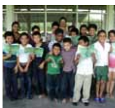
Photo: Biodiversity fair.

Guatemala: Lead by CONAP, many institutions were mobilized to organize activities. Information material was produced and distributed, such as bumper stickers, booklets, technical documents, and the National Strategy for