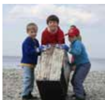
Photo: Locals learning an old fashioned, but very effective method to manage a small, but highly valued nature conservation site near Aalborg, Denmark.

Estonia: May was designated the National Nature Conservation month and many activities took place throughout the year: conferences, competitions, hiking trips, exhibitions.