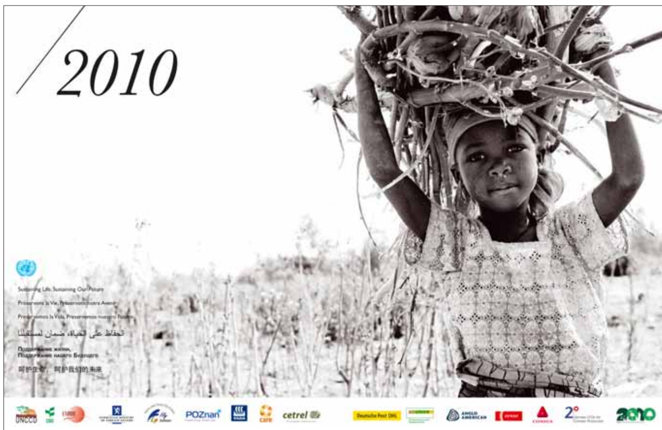
UN Calendar - Sustaining Life, Sustaining Our Future.