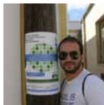
Photo: Biodiversity Action Day: People and organisations in 38 countries took part in this global project, www.biodiversity-day.info.

Greece: The European Centre for Environmental Research and Training collaborated with the Hellenic Network for Biodiversity Research to organise a conference; an Interdisciplinary Postgraduate Summer Training Program and