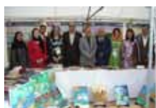
Photo: India's stamps for IYB 2010.

Iraq: The Ministry of Culture established a competition for children and professionals drawings on biodiversity within the platform of the celebration of IYB. It also contributed