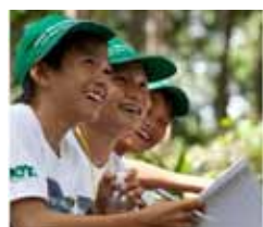
Photo: Guided tour at Hort Park Butterfly Garden.

Vietnam: A talk show and quiz on biodiversity for the celebration of IDB 2010 was held at Giang Vo Secondary School; more than 1,000 pupils took part. At the same time, a tree planting session was organized as part of the Green