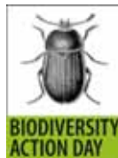
Photo: TF1 featured a Biodiversity Quiz to raise awareness about biodiversity

Germany: BMU established a web-based calendar of events: 1,500 events realised by more than 300 different organisers addressed practitioners, politicians, nature lovers, families and children.