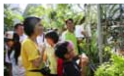
Photo: IYB material distributed to school children.

Singapore: The World Cities Summit 2010 brought together over 230 local and overseas participants among the government, academia, research and landscape