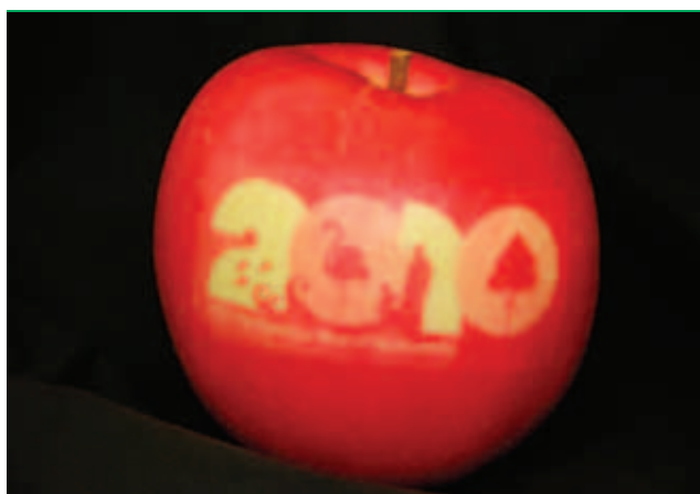
Organic apple marked with the IYB logo.