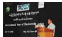
Photo: Minister Douglas Uggah Embas launching the campaign.

Myanmar: The Ministry of Forestry hosted the celebration of IYB. About 200 representatives from ministries and enterprises, international organizations such as