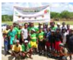
Photo: World Day for Biological Diversity. Instituto de la Costa Sur.

Guyana: Many IYB activities (exhibitions, environmental camps, tours, films, seminars, youth forums, etc.) were organised under the patronage of the EPA. These activities coincided with the preparation and submission of