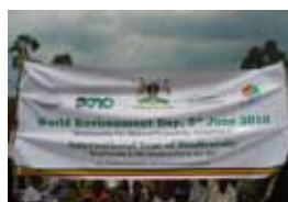
Photo: The Deputy Prime Minister speaking at the World Environment Day Symposium.

Uganda: The NCC celebrated IYB and WED on 5 June 2010. The theme "Biodiversity for National Prosperity. Conserve it". was chosen to enable all levels of society to appreciate the