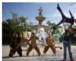
Photo: Conference in Kithira, Greece: "Europe and the Environment: The case of Climate Change and Biodiversity in the 21st century". Credit: EKEPEK

Hungary launched the competition for the "European Capitals of Biodiversity" among local authorities in France, Hungary, Germany, Slovakia and Spain. 43 municipalities competed in the national version