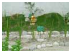
Photo: Myanmar's celebrations for IYB 2010.

Nepal: The International Centre for Integrated Mountain Development (ICIMOD) marked the IYB by organizing various activities including participation in global conferences and meetings, hosting