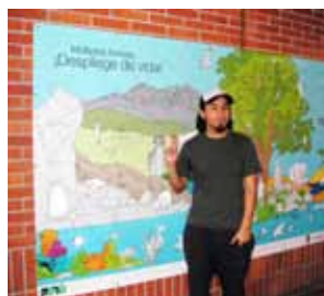
Photo: Short stories and poetry contest.

Colombia: The Humboldt Institute lead the campaign by creating an official website and facebook page (2000 fans). A series of conferences, seminars, competitions were organized and publications and videos were produced for dissemination.