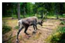
Photo: The Living Façade project 2010, European Environment Agency (EEA).

Finland organized a number of events, seminars and other activities in different parts of the country, ex. competition for the 'The Best Landscape project in Finland'. A set