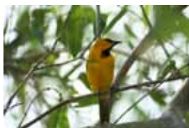
Photo: IYB stamp (set of 4).

Suriname: The Ministry of Labour, Technological Development and Environment communicated the IYB messages through television and media, and also organized