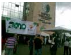
Photo: Workshop on Invasive Alien Species in Protected Areas.

Ecuador: A series of events were organized at the national and the provincial level. More than 45 organisations, as well as the MoE, took part in a large arts and music festival. A TV spot, a widespread