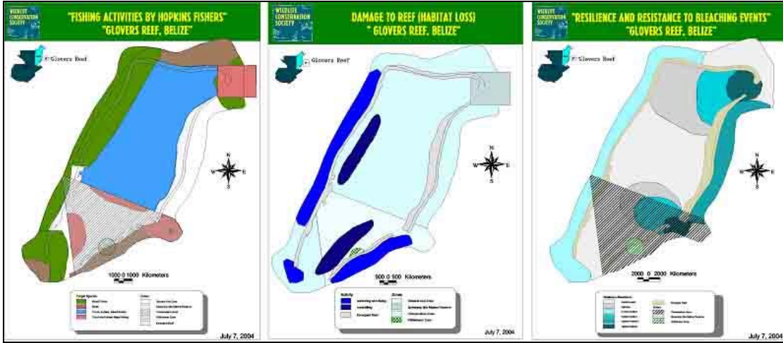
Figure 1. The 3 most severe threats around Glover's Reef Atoll, Belize (species depletion, habitat loss, pollution) digitized from hand-drawn maps.