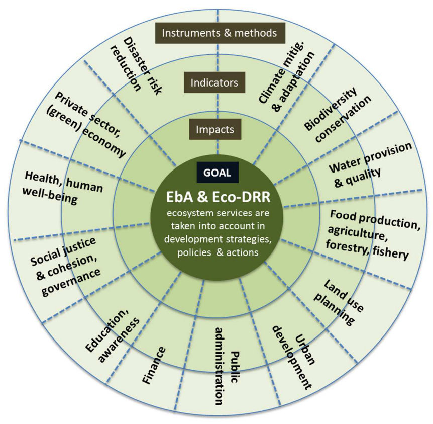
Figure 2. Entry points for mainstreaming EbA and Eco-DRR within key development and sectoral strategies by embedding ecosystem-based approaches into existing instruments and methods tools, selecting appropriate indicators for monitoring and evaluation, ensuring successful impact by developing a theory of change

20. Considering the information provided above, a simple framework for mainstreaming EbA and Eco-DRR into development and sectoral plans is presented as supplementary information<sup>19</sup> in Figure 2.