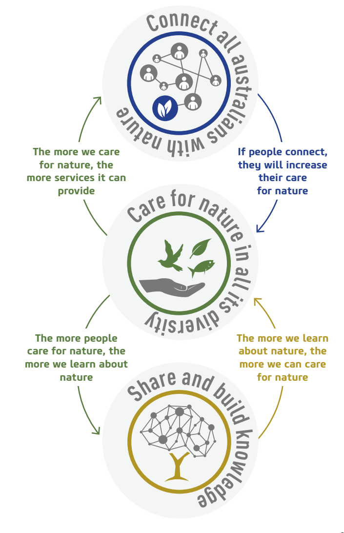
Figure 2: How the strategy's goals link together

The strategy has three priority focus areas, or goals , underpinned by twelve objectives . The goals work together in continuous loops designed to reinforce each other (Figure 2). By connecting people with nature, we enhance their desire to care for nature, which in turn builds knowledge that can be shared to improve our care for nature and the benefits we receive from connecting with nature. Each objective has a number of progress measures , which will be used to track and report on the success of the strategy.