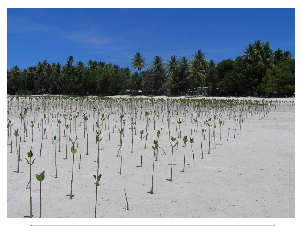
Photo 1: Mangrove plantation in Funafala islet, Funafuti. An adaptation project funded by Tuvalu Overview (NGO).

After the synchronization process, the same issues were further assessed with the view to align them with the standard phrasing and interpretations used commonly at the global level while of course maintaining the Tuvalu context as much as possible. The result of this analysis is shown in Tables 2 and 3 below which now constitutes the main component of the Tuvalu National Biodiversity and Strategy and Action Plan.