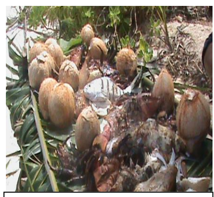
Green coconuts, normally used by Tuvaluans for drinking

sustainable management and use of existing conservation areas and establish more conservation areas throughout the nation