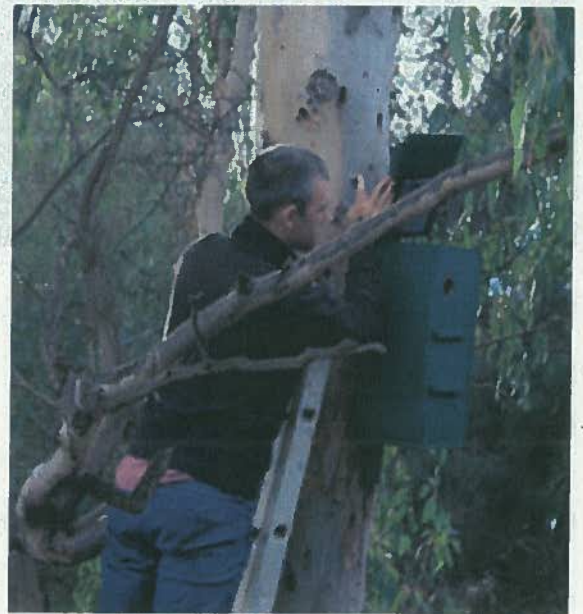
Researchers monitored hundreds of nest boxes used to offset habitat loss.

Senior Lecturer, Australian National University