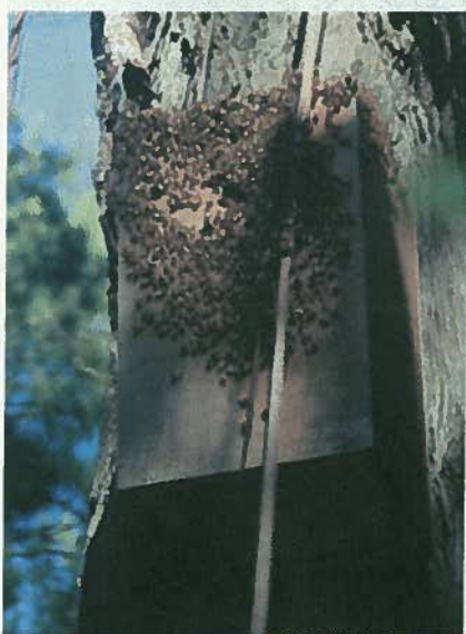
Wild honeybees occupied many nest boxes.

The roadworks required the removal of large, old, hollow-bearing trees, which are critical nesting sites for many animals, including several threatened species. To compensate for these losses, the developer was required to install one nest box for every hollow that was lost – roughly 600 nest boxes were installed.