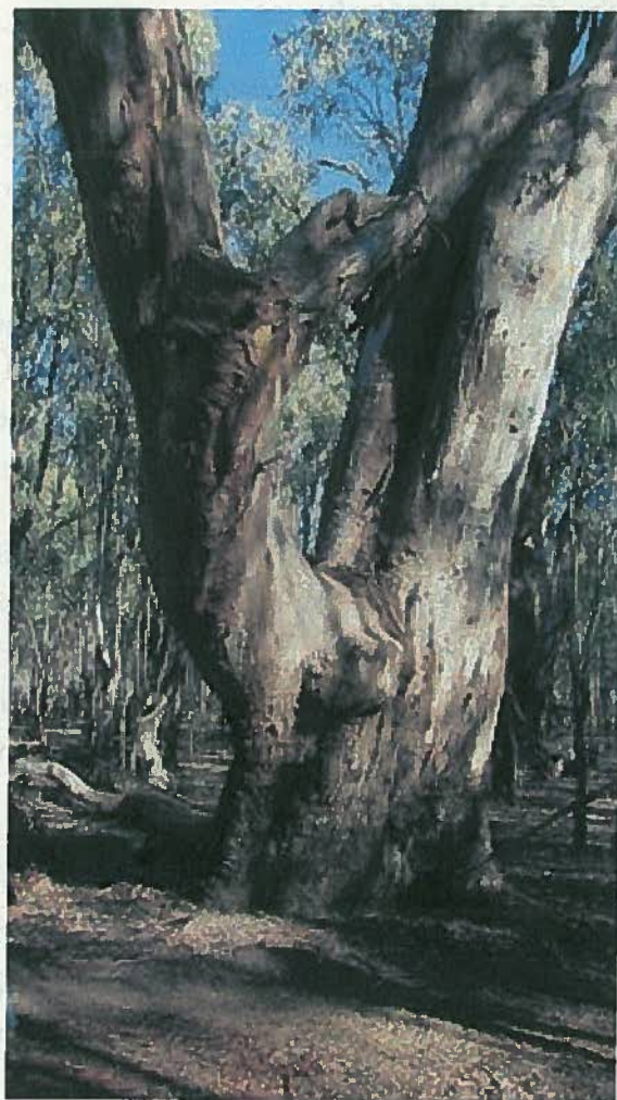
An old hollow-bearing river red gum. Trees like this are vital habitat for many species.

The poor results of the Hume Highway offset program are sobering. However, organisations like