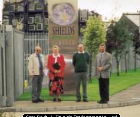
Case Study 1 Shields Environmental Ltd