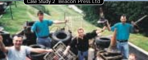
Case Study 2 Beacon Press Ltd