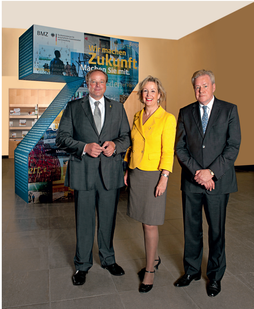
Dirk Niebel, MdB

Federal Minister for Economic Cooperation and Development