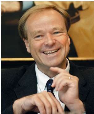
Dirk Niebel Federal Minister for Economic Cooperation and Development