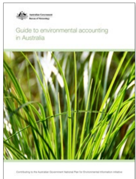
Figure 1. The Guide to environmental accounting in Australia .

Part C is a compendium of technical reference material to support the purpose, concepts, and fundamentals of environmental accounting described in parts A and B.