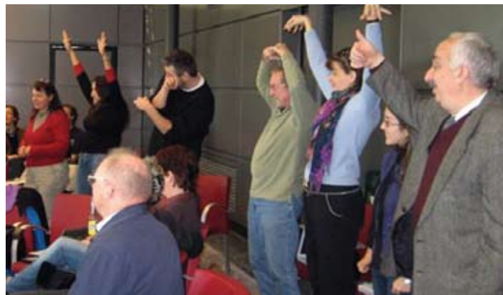
Some civil society representatives pretending to be trees in Rome, Italy just prior to the 13th SBSTTA.