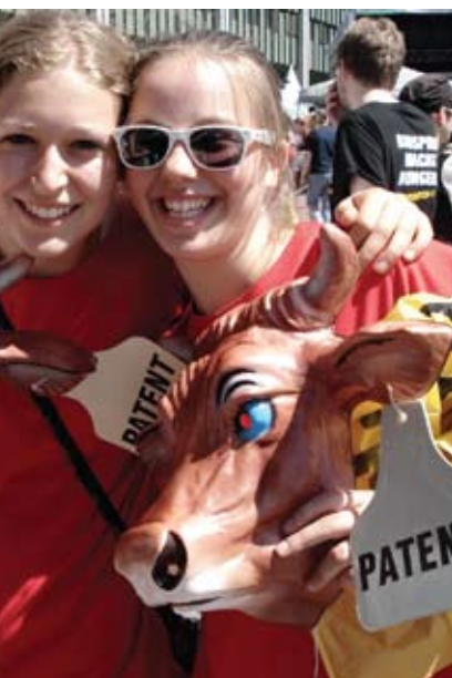
Biodiversity demonstration, Bonn, 12 May 2008.

The process in the CBD is a negotiation about genes and traditional knowledge. In many cases, these genes arise from our territories, lands and waters and the knowledge related to those genes is ours. Therefore, any decision making about the rules to regulate the buying and selling of those genes and Indigenous knowledge must include our right to make our own decisions about what will be the best path for our future generations based on our own cultural and spiritual beliefs and related customary and/or codified laws. ✎