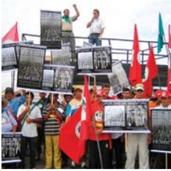
Lively demonstration at COP-8, lead by Movimento dos Trabalhadores Rurais Sem Terra (MST).