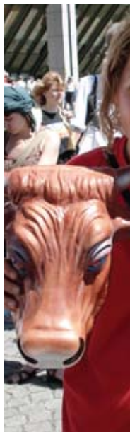
Participants at the Planet D